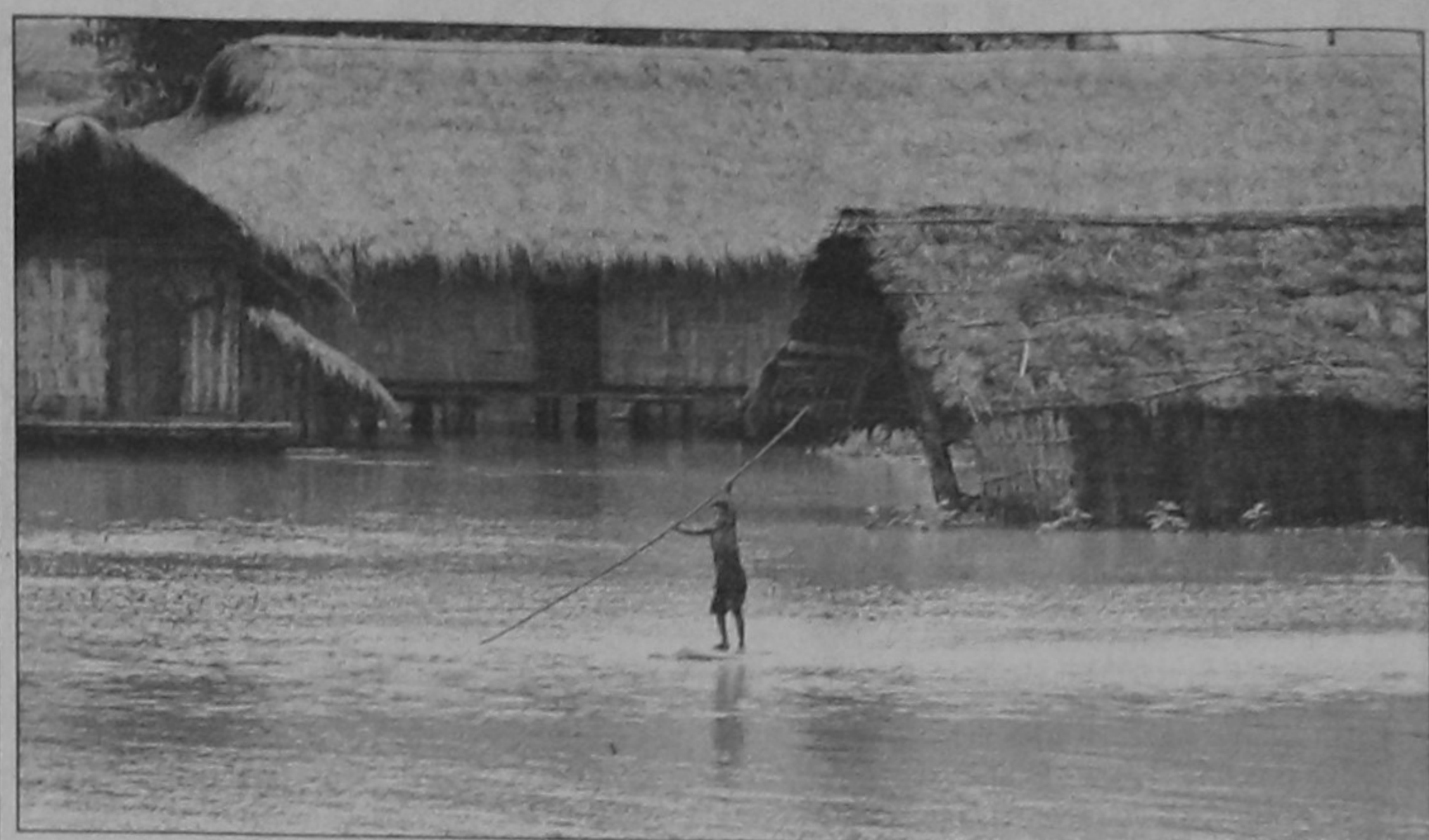
An Indian child paddles through floodwaters on a banana raft in the Matmara area of North Lakhimpur district, some 470km east of Guwahati yesterday. A third wave of monsoon floods have hit the Assam state with many districts affected including Majuli Island, the biggest river island in the world. Vast tracts of land have been inundated forcing residents of some 450 villages to take shelter on higher ground.

He said he had not at all mentioned anything about the involvement of the Speaker's office.