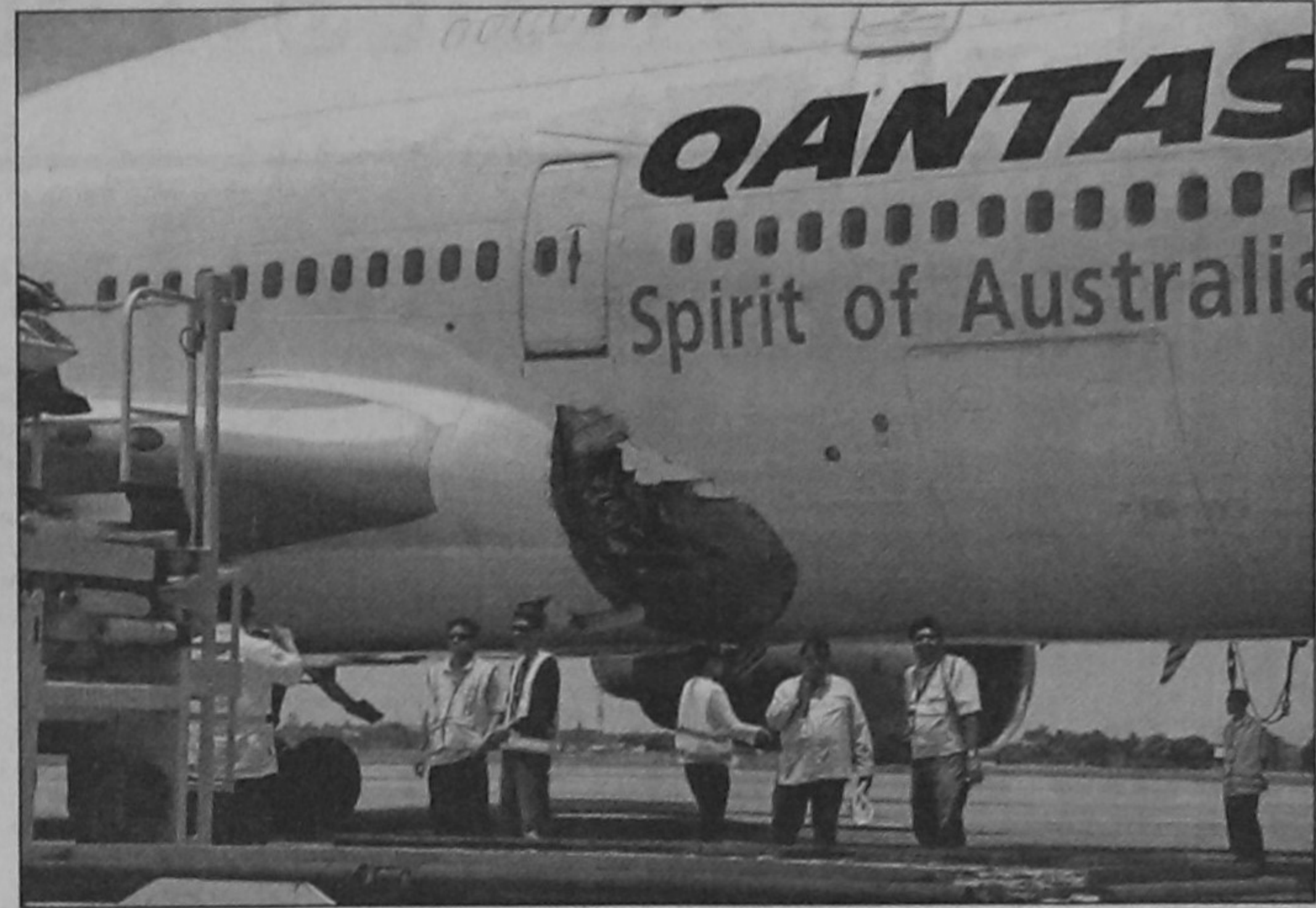
Workers and security personnel stand next to the hole of a Melbourne bound Qantas Airways Boeing 747 after it made an emergency landing at the international airport in Manila yesterday.