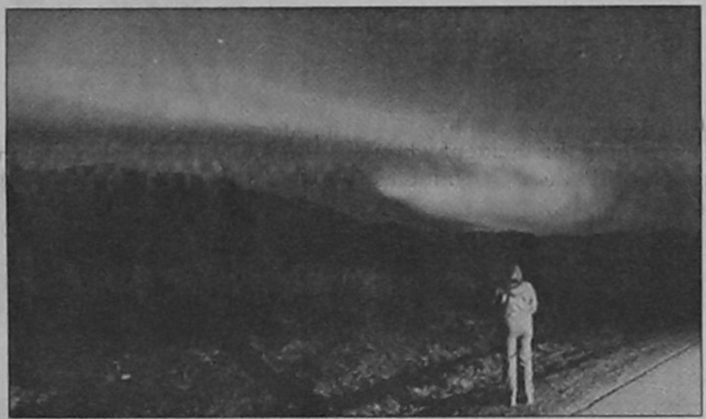
In this Sept. 3, 2006 file photo a spectator watches the aurora borealis rise above the Alaska Range in Denali National Park, Alaska.

Rice said. "Since this president came into office, the notion of two states living side by side in peace and security has just become kind of common wisdom. We all say it. "Well, in fact, in 2001, that was not the position either of the Likud Government of Ariel Sharon or of much of the international community."