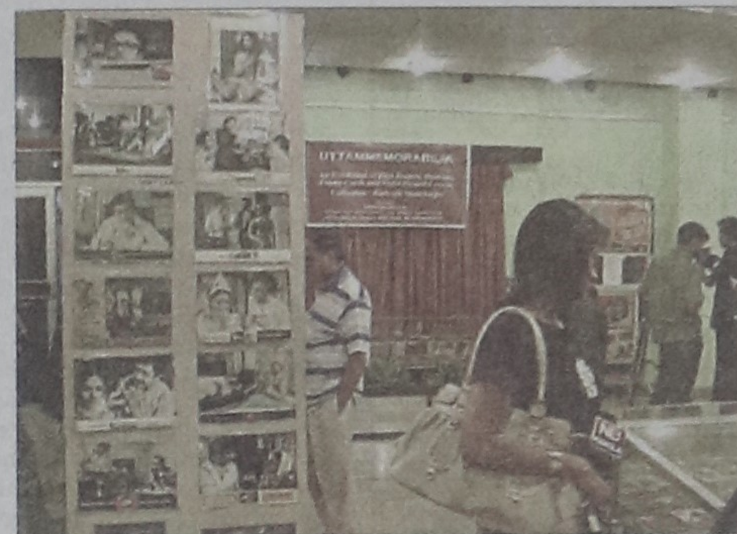
Visitors at the Uttam Kumar Memorabilia