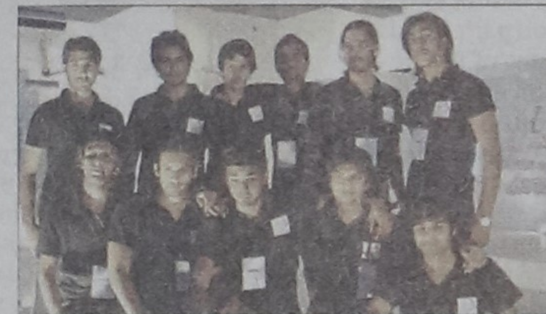
Male (left) and female finalists of Pantene You Got The Look 2008