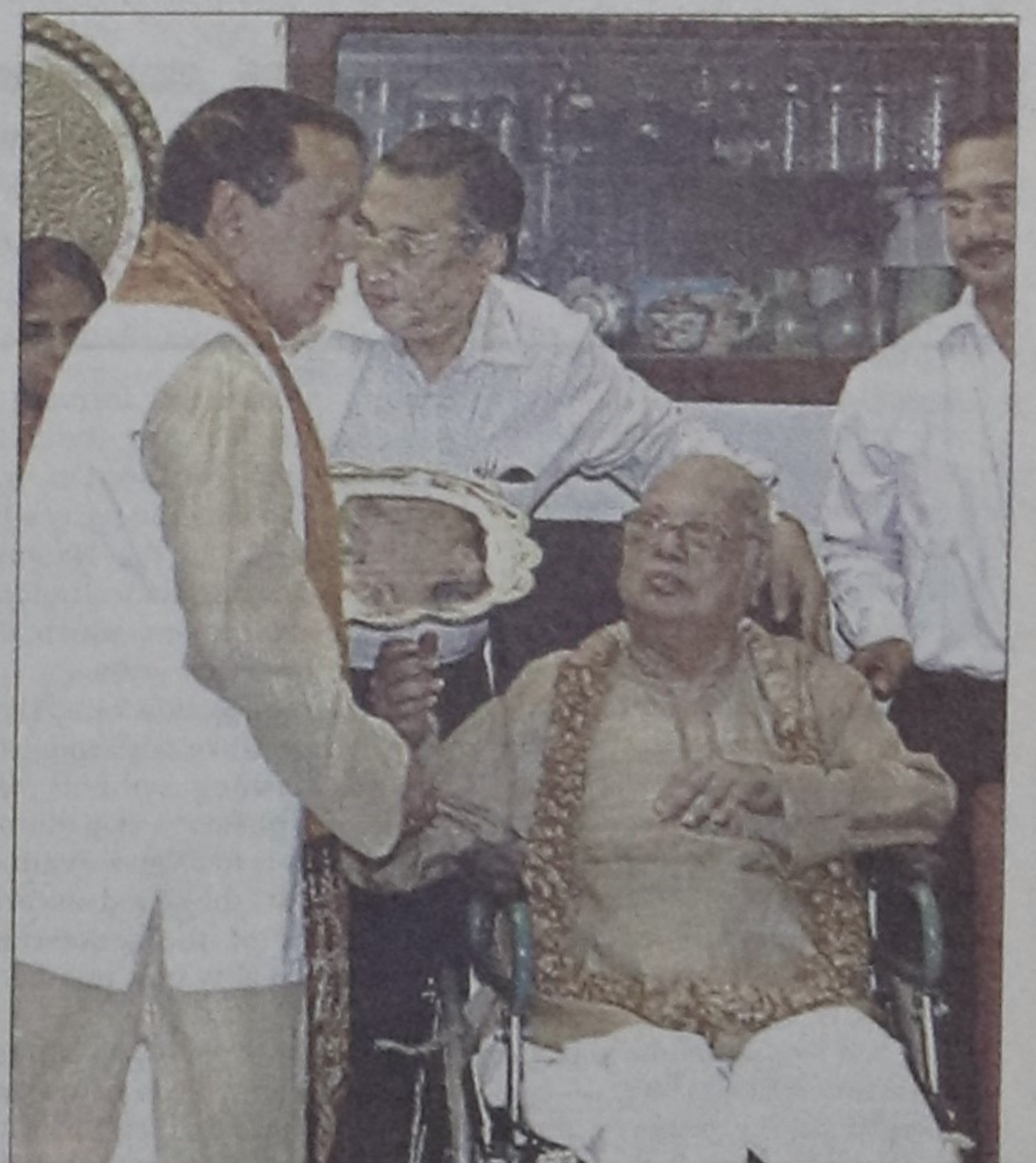
Priyaranjan Dasmunshi recently felicitated Tapan Sinha (seated) with a lifetime achievement award in Kolkata

A government-appointed committee which chose Tapan Sinha for the Dadasaheb Phalke award included eminent directors Shyam Benegal, Gautam Ghose, actress Sharmila Tagore and renowned flutist Hari Prasad Chaurasia.