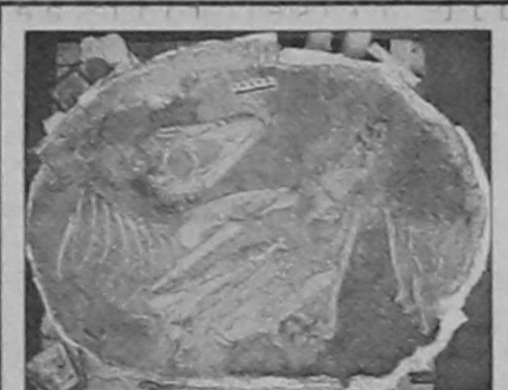
The fossilised bones of a juvenile Tyrannosaurus.

AP, PTI, Vienna Pakistan has warned a deal leading to increased Indian access to nuclear fuel could accelerate the atomic arms race between the rivals, according to a letter obtained on Wednesday by The Associated Press.