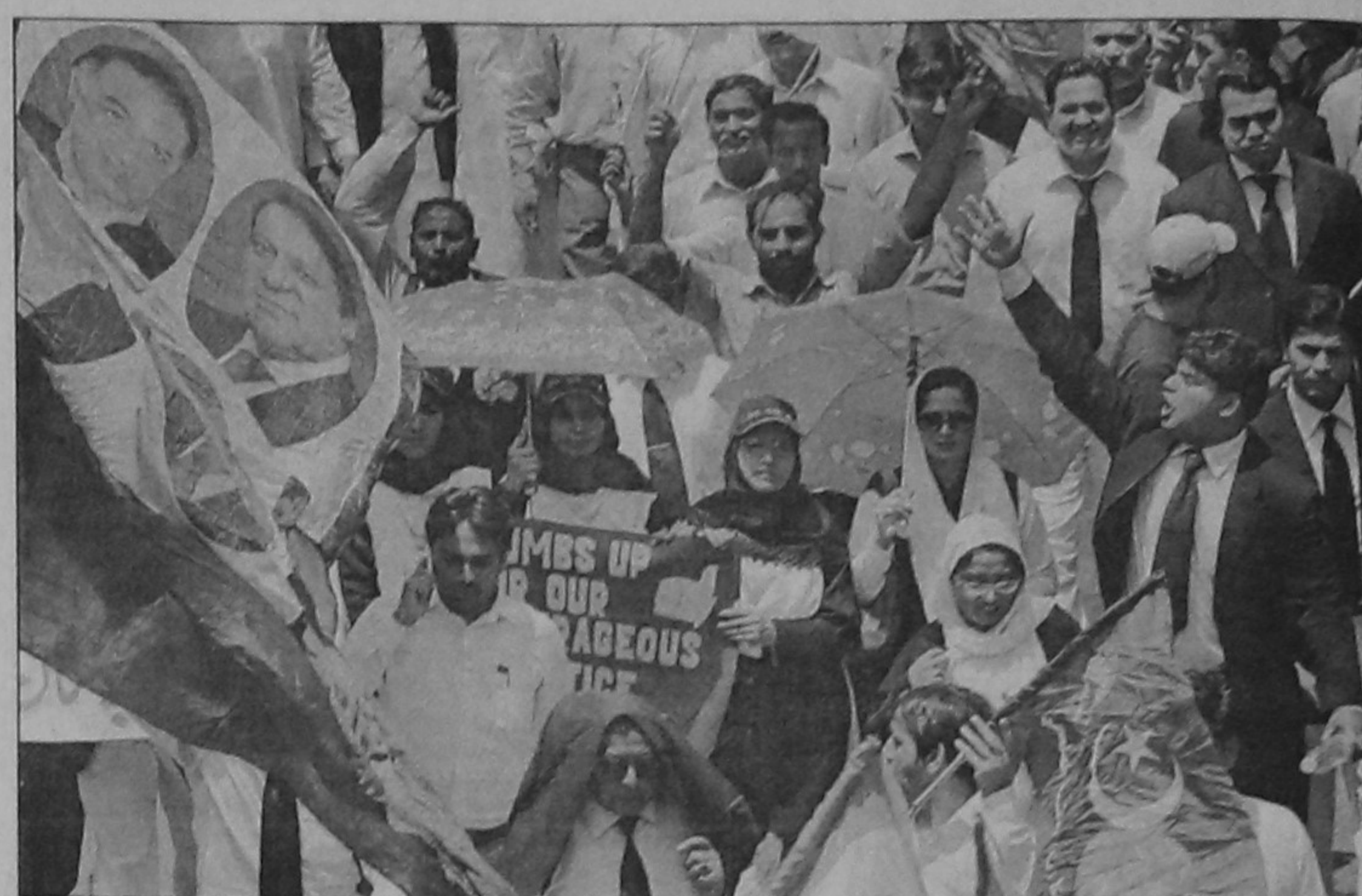
Pakistani lawyers and political activists wave placards as they march in Lahore yesterday demanding reinstatement of sacked judges. The two main ruling coalition parties agreed to reinstate the judges when they originally formed the coalition in March this year, but have failed to agree on how to do it.

Deaths of western troops in Afghanistan have exceeded those in Iraq for the last two months, while the bombing of the Indian embassy in Kabul and a militant raid that killed nine US troops this month have also set alarm bells ringing.