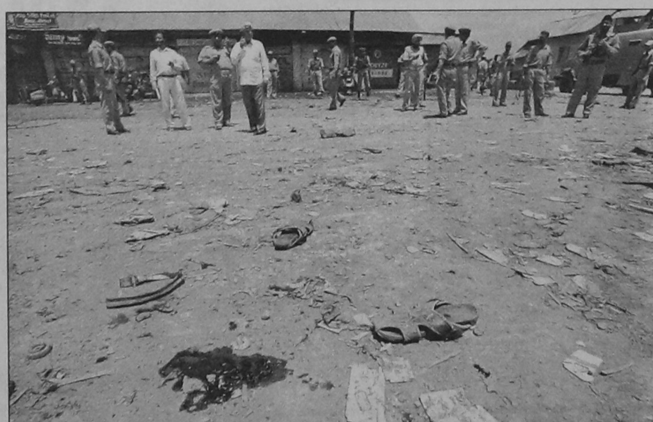
Indian police officers stand at the site of a grenade attack in Srinagar yesterday. At least nine people, including women and children, were killed in fresh outbreaks of violence in Indian Kashmir, officials said.

had surrendered in 2004, earning himself a place on a militant hit-list. He was killed in Doda district, about 170 kilometres (105 miles) south of Srinagar, hours after a separate grenade attack also left two policemen and a civilian wounded.