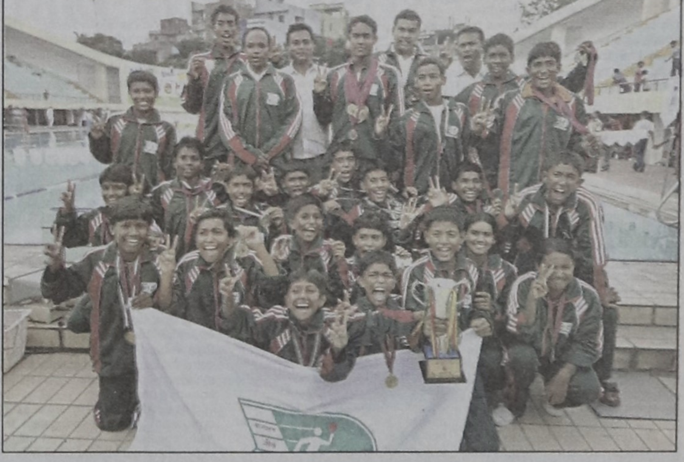
Members of the BKSP team are jubilant after winning the 24th National Age-Group Swimming Competition at the National Swimming Complex in Mirpur yesterday.