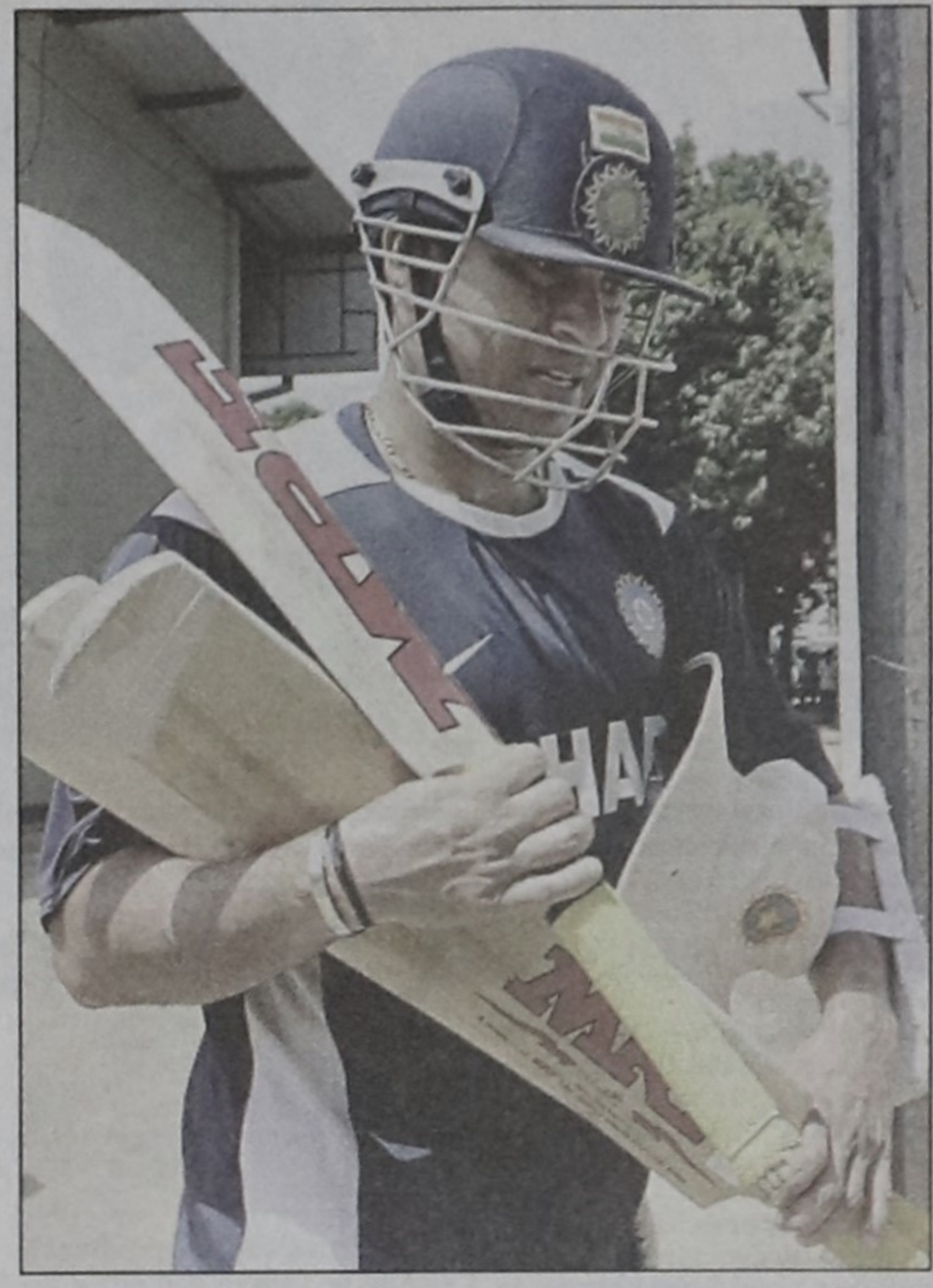
THINKING OF THE RECORD? India's batting maestro Sachin Tendulkar arrives for a practice session at the Sinhalese Sports Club Ground in Colombo yesterday. With 11,782 runs, Tendulkar is just 172 runs away from becoming world's leading Test run-getter.