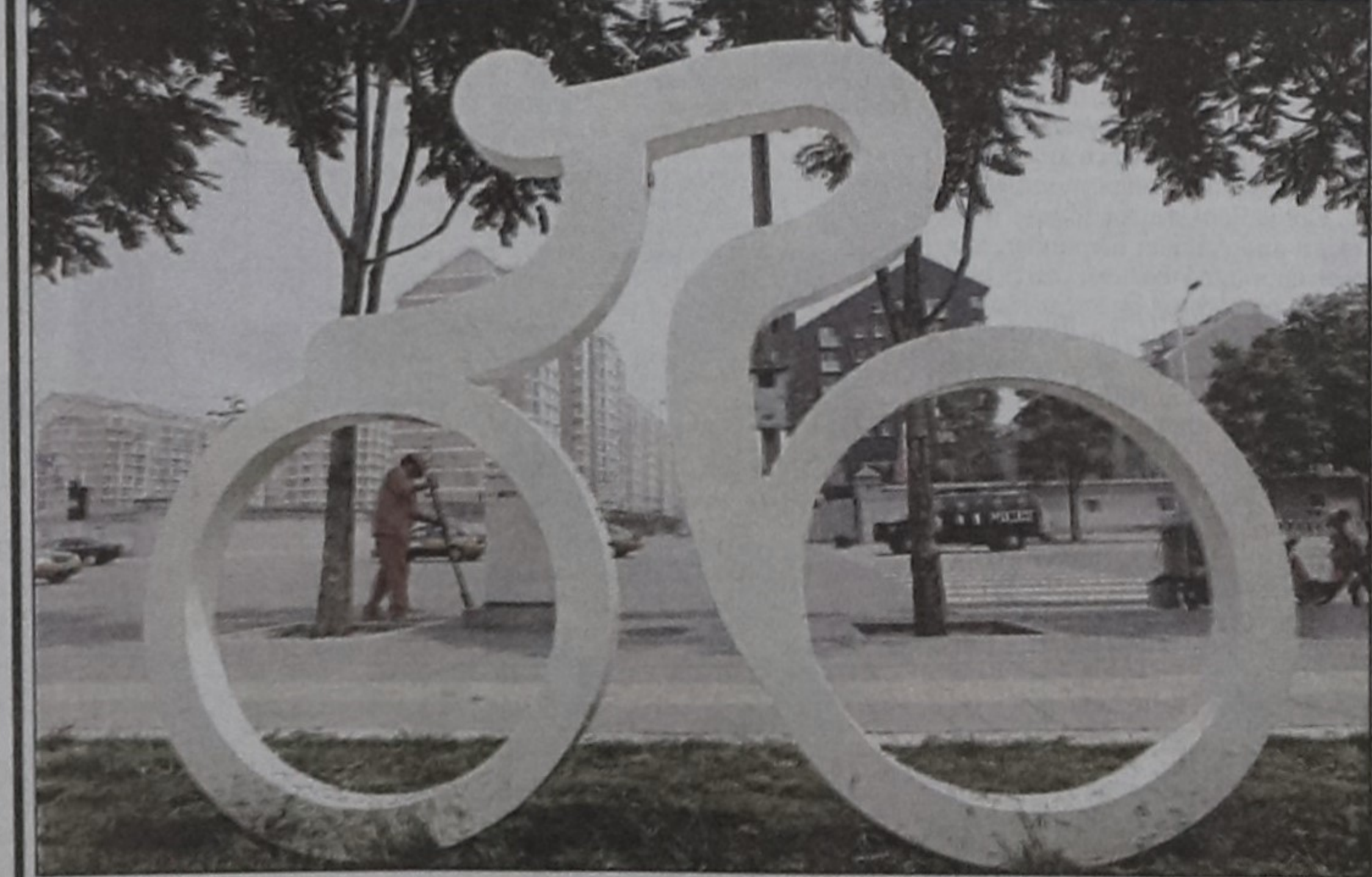
An Olympic-theme sculpture decorates a street of Beijing. The photo was taken yesterday.