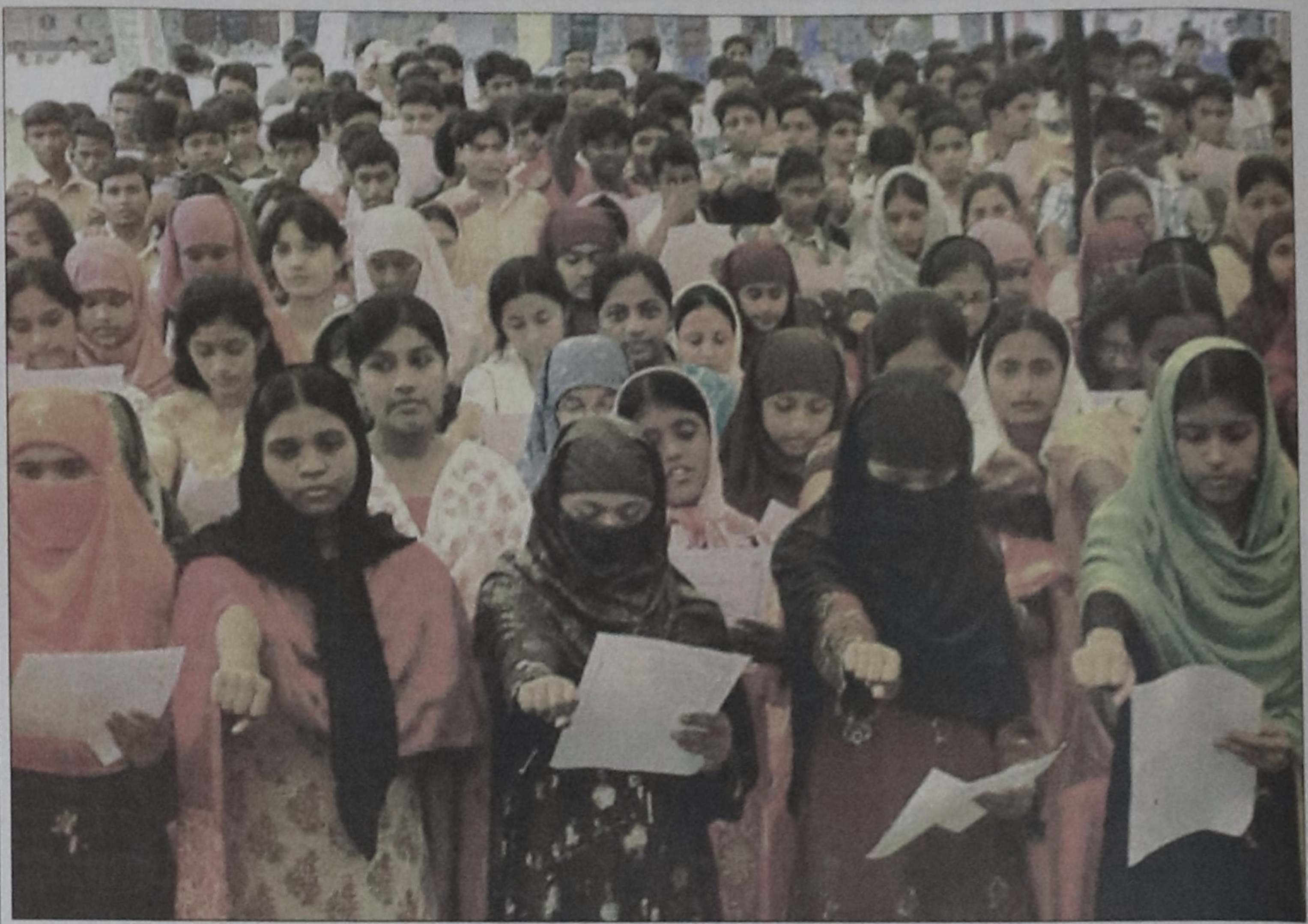
BRIGHT STUDENTS AGAINST GRAFT: One hundred and eighty GPA-5 achievers of Harimohon Government High School in Chapainawabganj town at a reception accorded by Sachetan Nagorik Committee of TIB yesterday taking oath not to involve in corruption.

The 25 trees on the median on Gulshan Avenue include raintrees, debdaru, banyan, akatha, epil-epil, mango, chatuyan and berry trees. Others include three trees adjoining the British High Commission in Baridhara, one kishnachura near road-27, block-J in Banani, eight acacia trees on Madina Avenue road island, one mahogany on road-18, block-B in Banani, one cotton tree at the corner of road 24 and 39 in Gulshan, a mango tree at the corner of road-24 and 30 in Gulshan and a kishnachura and mahogany tree at road 56 and 70 in Gulshan, a mango tree on the DCC field behind Wonderland in Gulshan, seven debdaru trees at CWS (A)-1, Gulshan road-34 and one debdaru tree in Gulshan road-79.