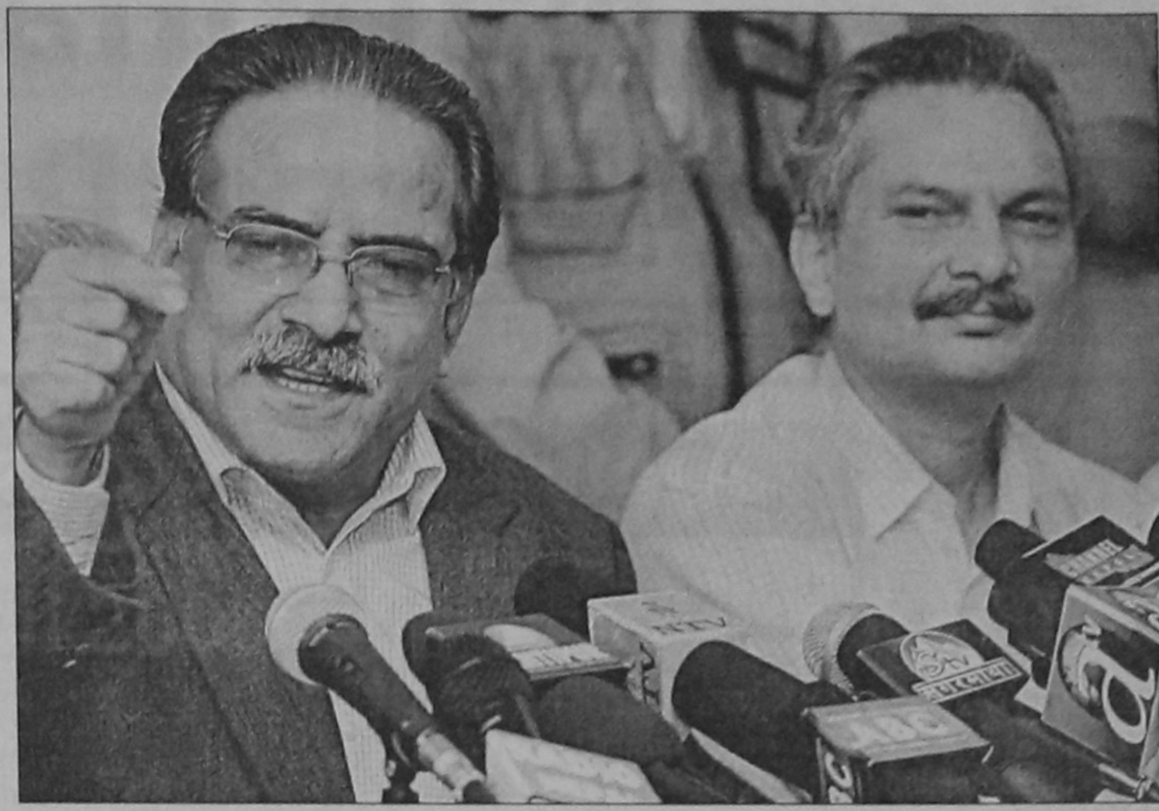
Former rebel leader and chairman of the Communist Party of Nepal Maoist Pushpa Kamal Dahal (L) addresses media representatives as Maoist second in command Baburam Bhattarai (R) looks on during a press conference in Kathmandu yesterday. Nepal's Maoists said they would not form the Himalayan nation's first post-royal government after the defeat of their candidate for president, setting off a new political crisis.

"But one has to remember even god has an alternative. If worst comes to worst, we will find an alternative to Maoist government."