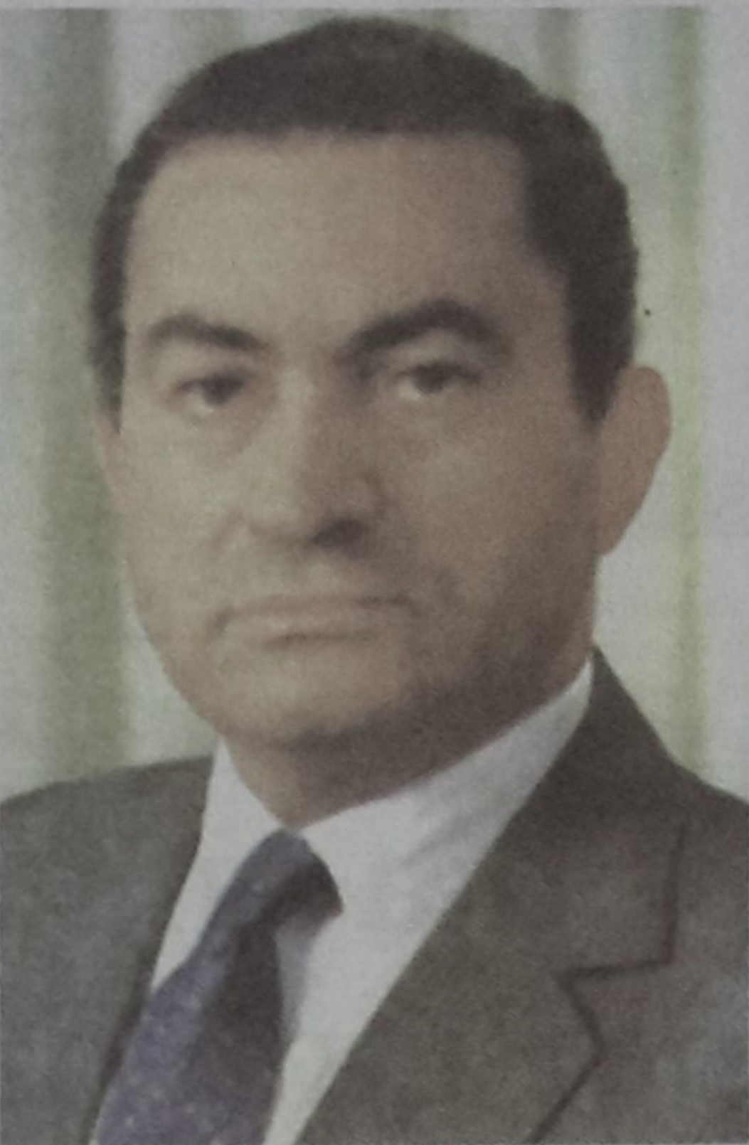
Mohamed Hosni Mubarak President of the Arab Republic of Egypt