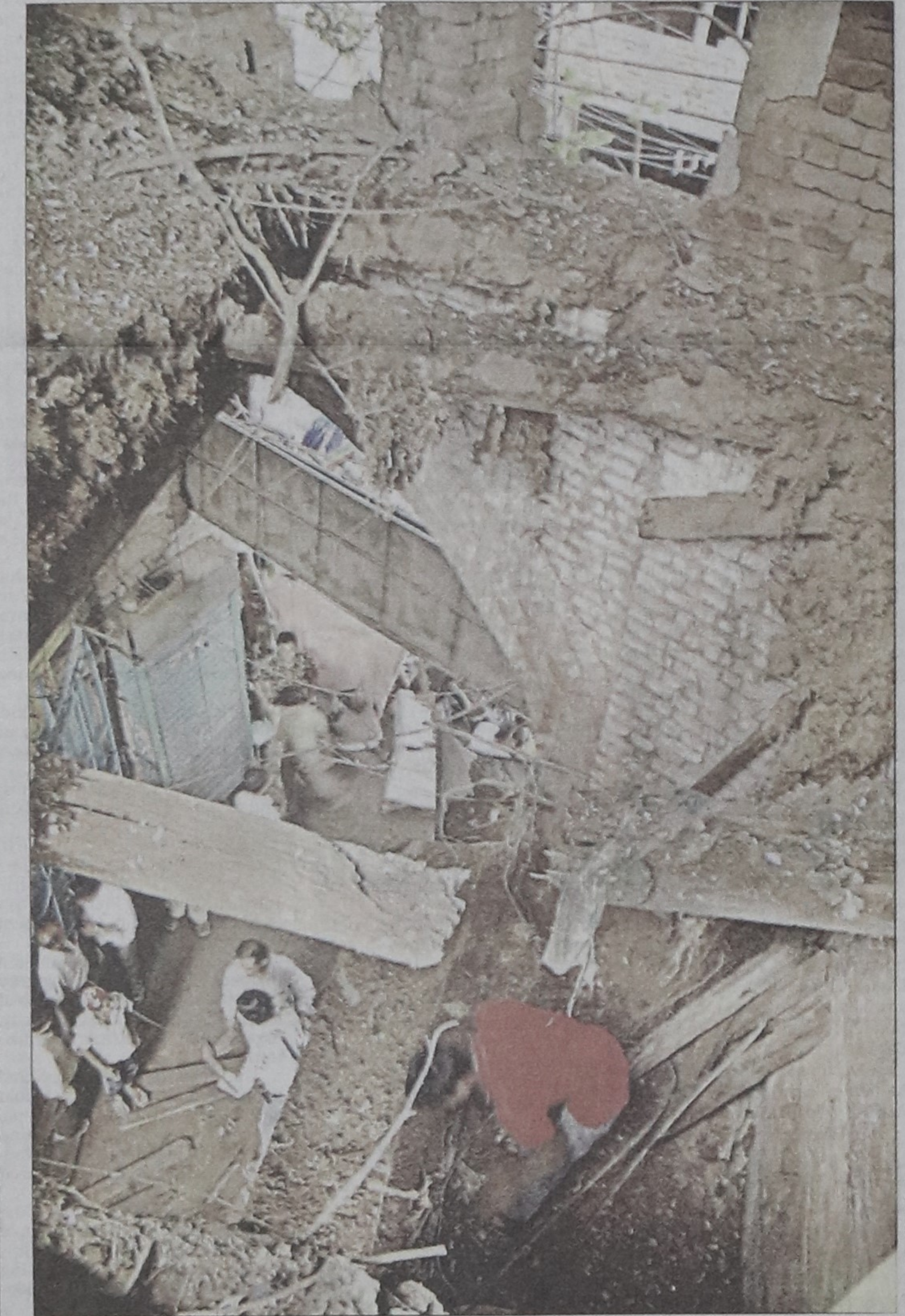
The wooden ceiling of the gate of Ahsan Manzil in Old Dhaka collapsed yesterday indicating the authorities' lack of proper maintenance of the historic palace.