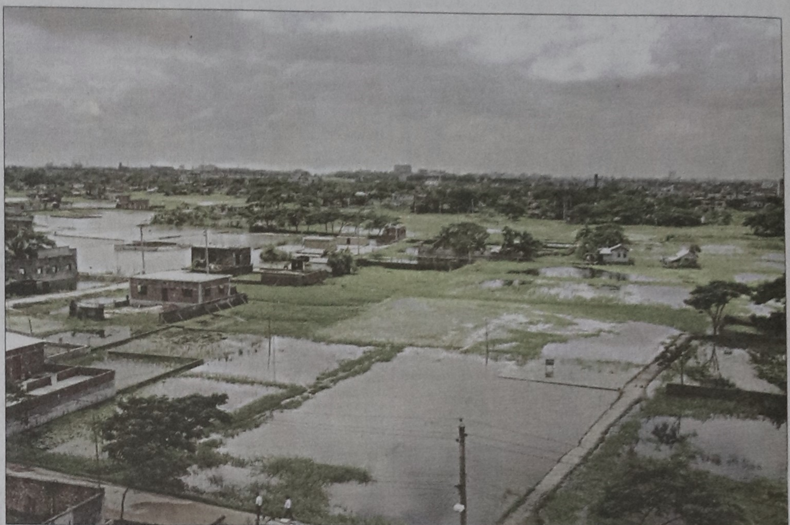
Indiscriminate fish farming in Dhaka-Narayanganj-Demra dam area is one of the reasons for continual waterlogging there. This photo of a few fish farms was taken at Demra.