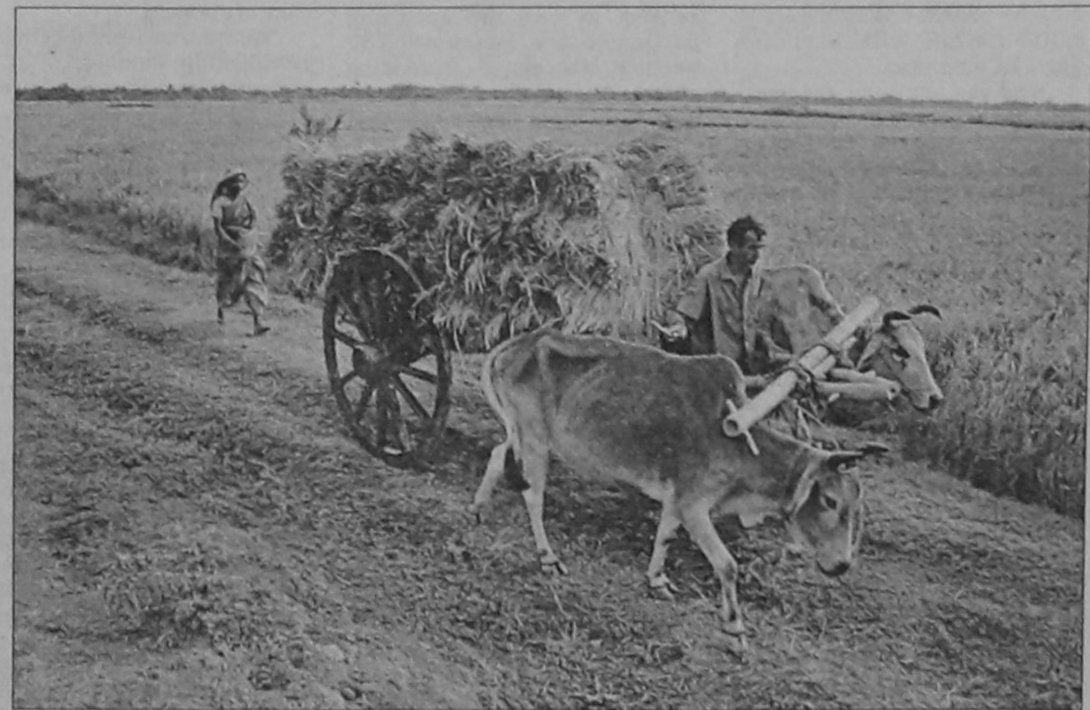
FIROZ GAZI / DRINKNEWS