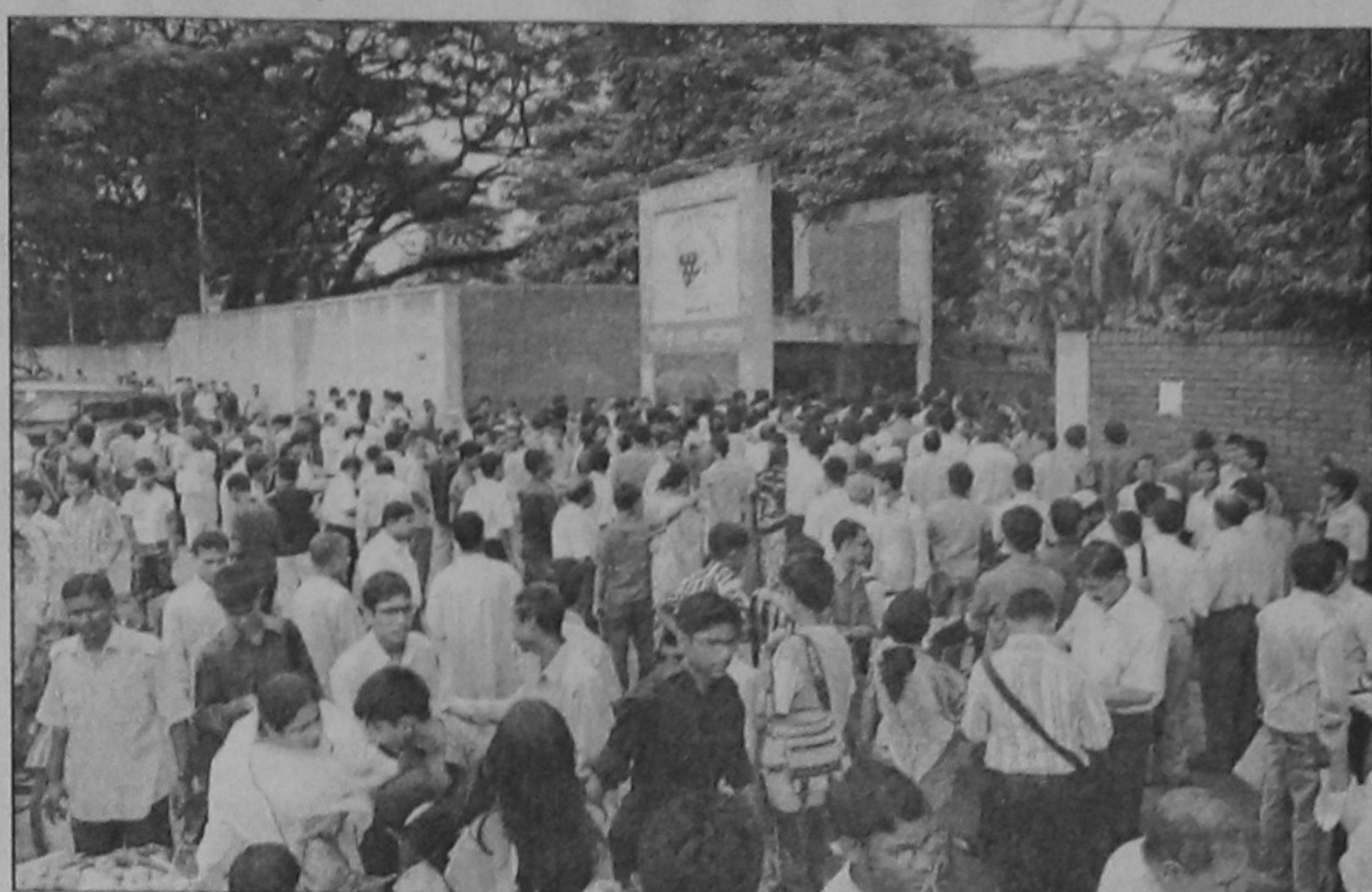
Admission seekers and their guardians wait outside the Notre Dame College in the city yesterday as the college starts taking interview of interested candidates.

Dhaka Metropolitan Unit Command of Bangladesh Mukti Juddha Sangsad will form a human chain protesting assault on a freedom fighter. Venue: Moghbazar to Banglamotor. Time: 4:00pm.