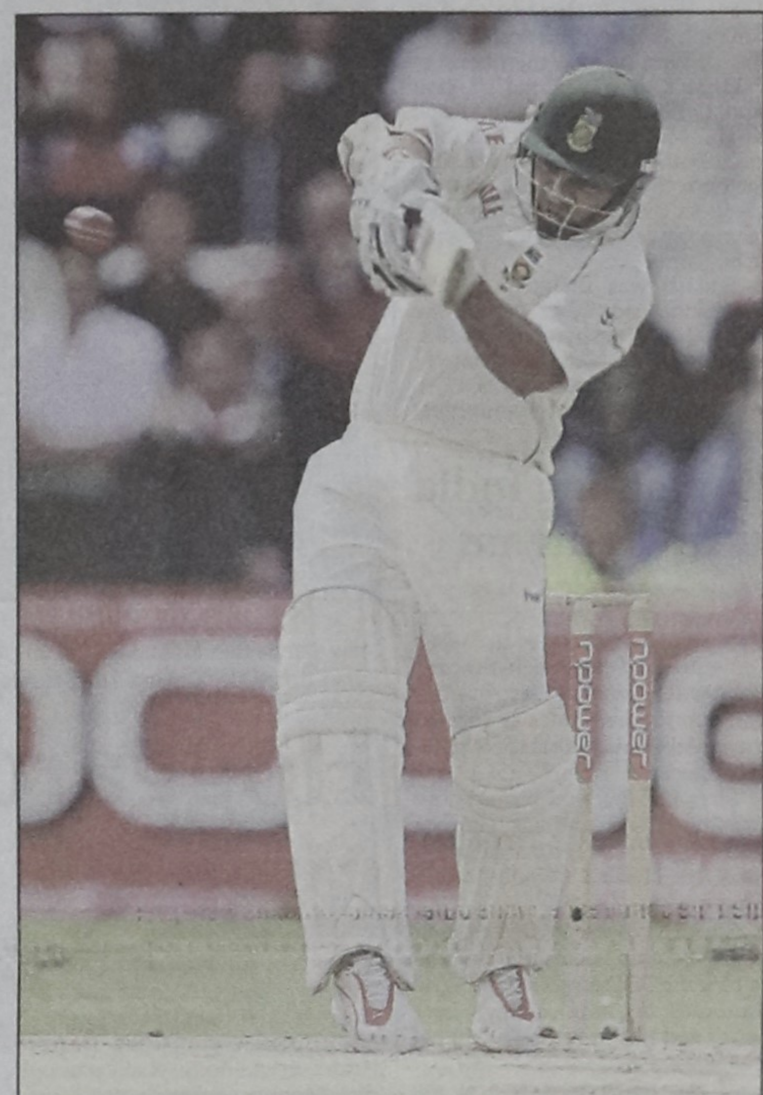
South Africa batsman Ashwell Prince pulls one during the second day of the second Test against England at Headingley on Friday.