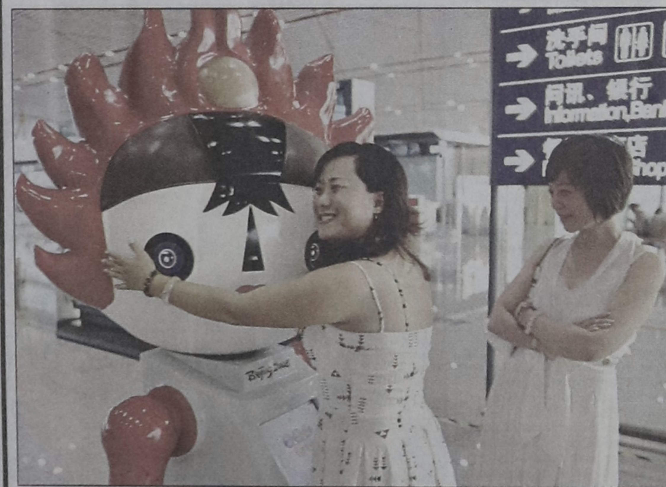
A Chinese woman hugs a robotic version of the Olympic Games "Fuwa" mascot at the new International airport in Beijing on Friday.