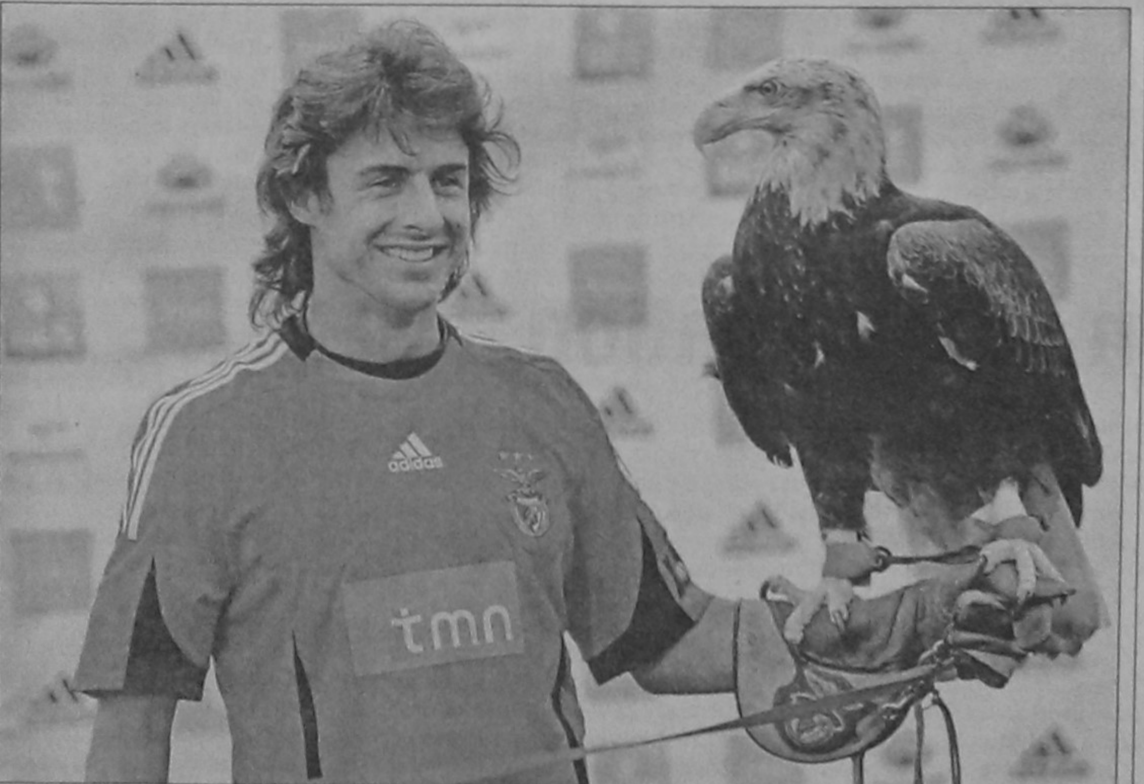
Argentinian midfielder Pablo Aimar poses with the team's mascot Vitoria (Victory) during his public presentation at the Luz Stadium in Lisbon on Thursday.