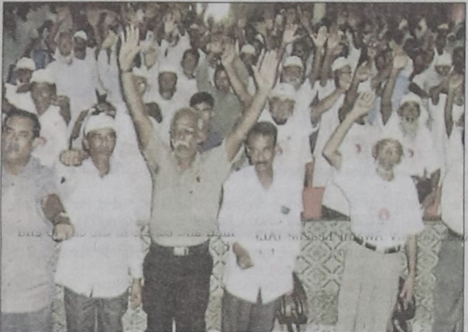
Magura freedom fighters raise hands at a meeting in the town, left, and Sangskritik Jote forms a human chain in Dinajpur yesterday demanding Jamaat-Shibir men's punishment for assaulting a freedom fighter in the capital on Friday.