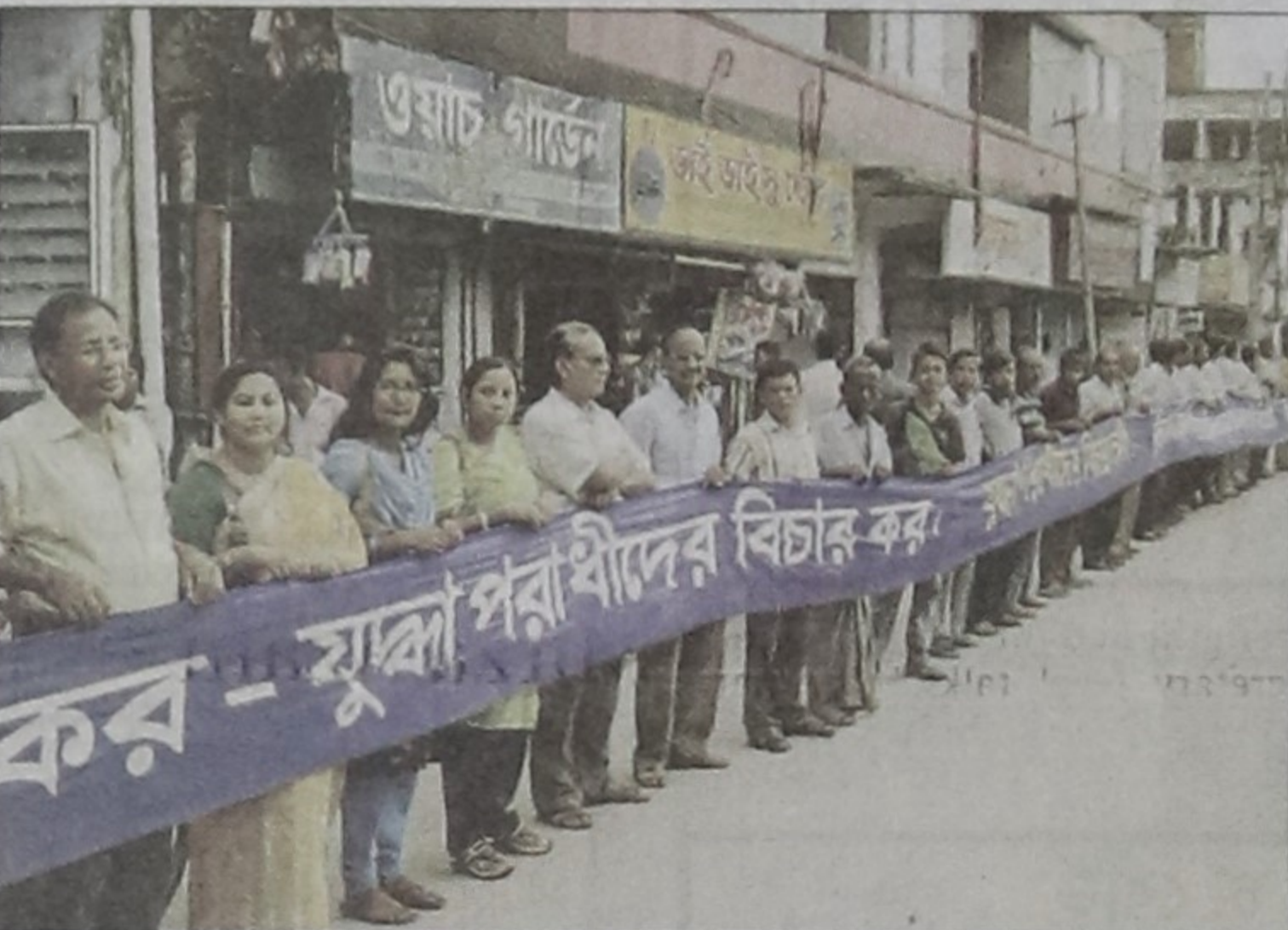
Sangskritik Jote forms a human chain in Dinajpur yesterday demanding Jamaat-Shibir men's punishment for assaulting a freedom fighter in the capital on Friday.