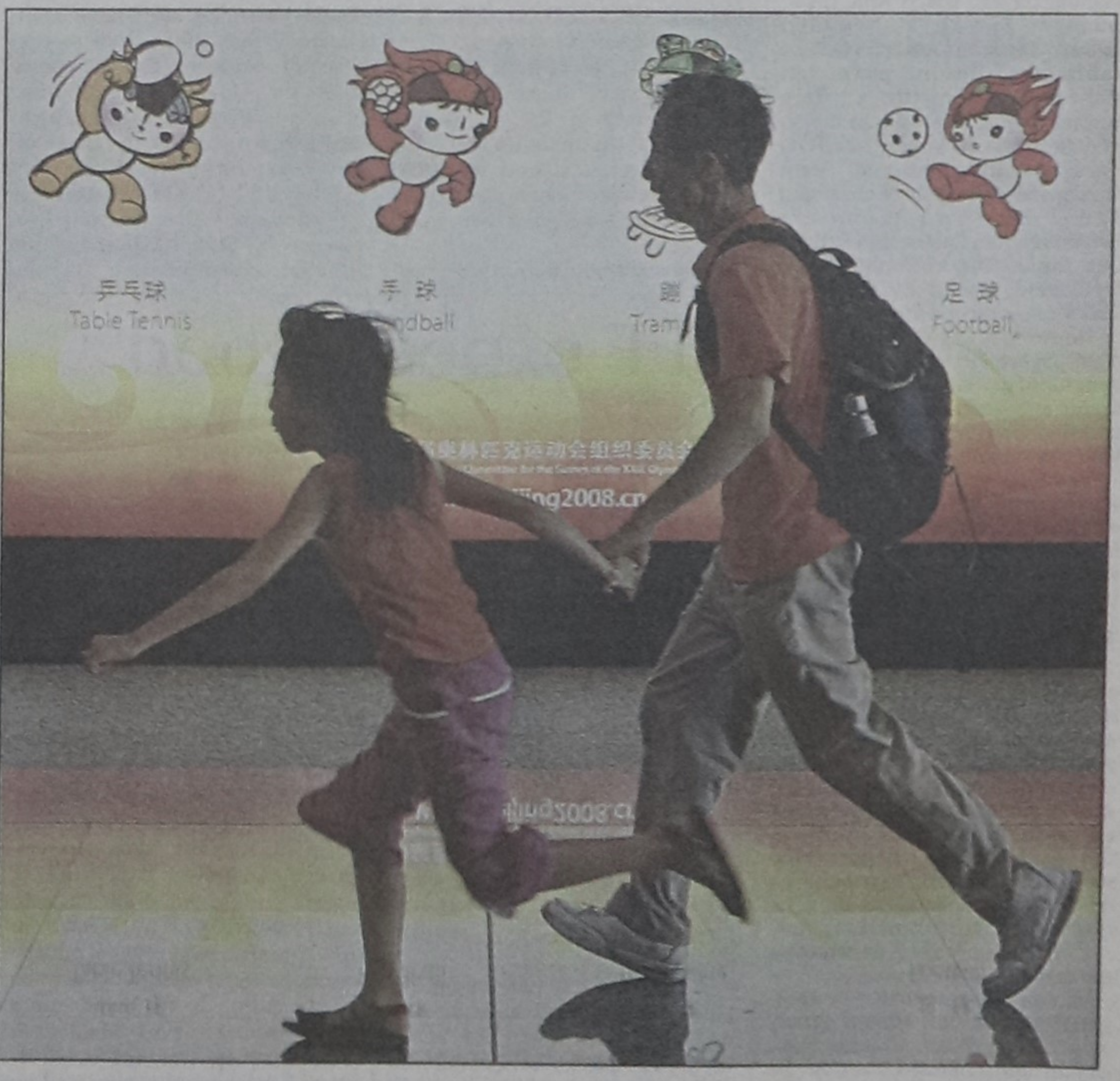
Two tourists walk past the Olympic 'Fuwa' mascots as they race for their flight at the new international airport in Beijing on Tuesday.