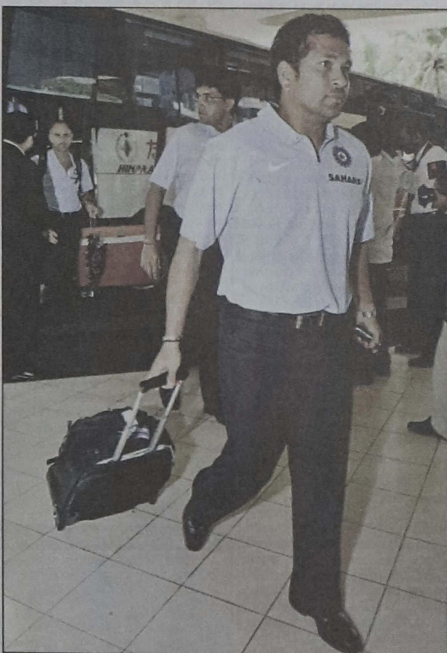
India star Sachin Tendulkar leaves the team bus upon the team's arrival at Colombo on Tuesday.