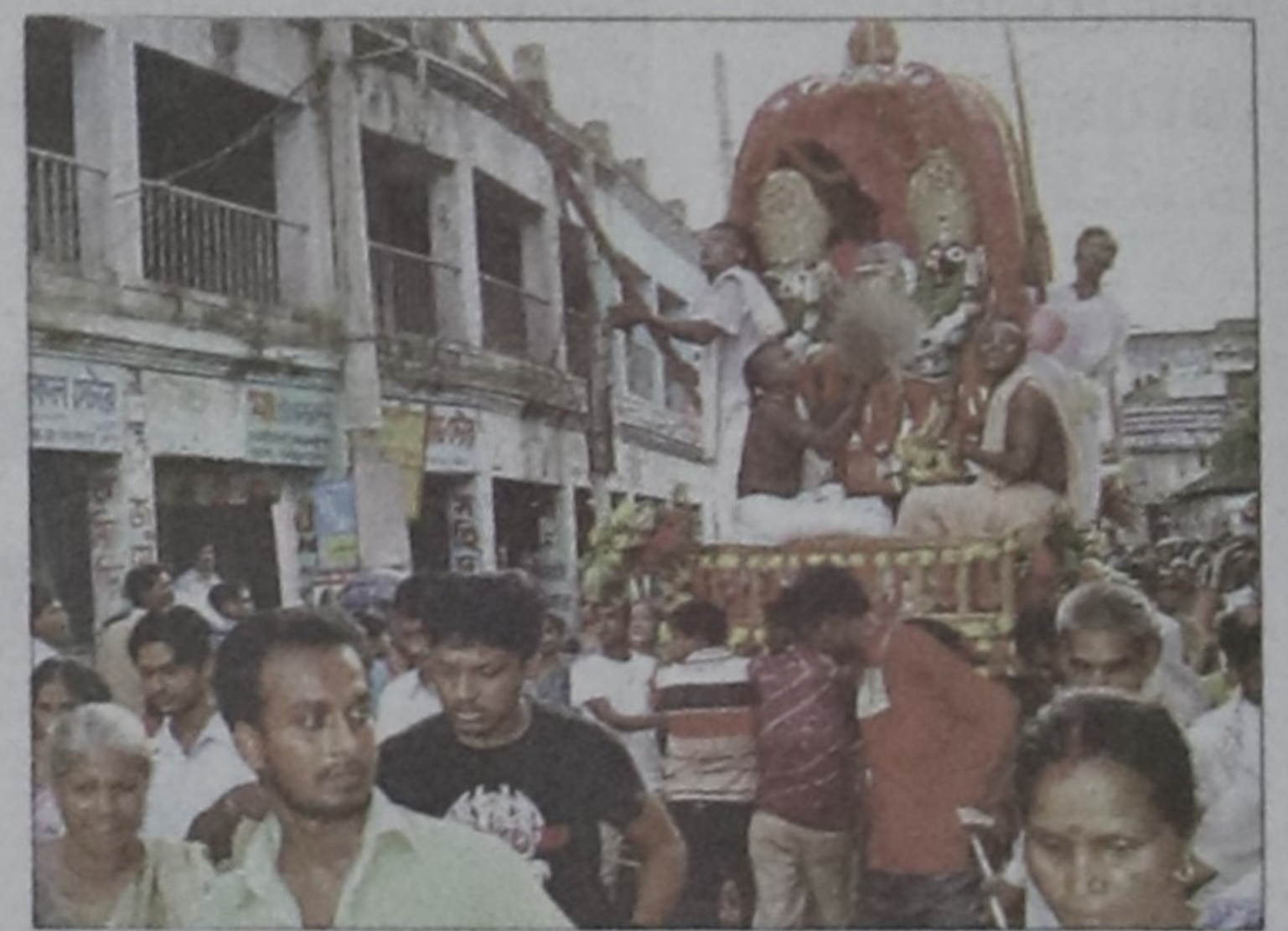
A view of the Ulto Rathjatra.

A traditional mela was also held at the Baro Kalbari temple premises on this occasion.