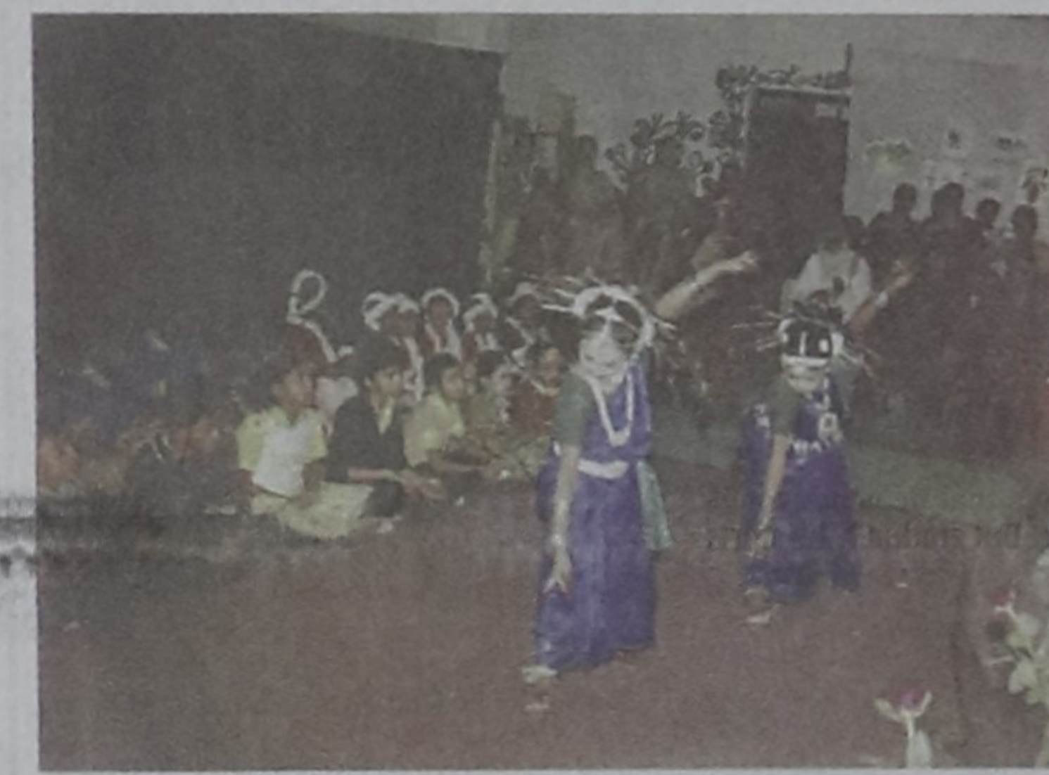
Child artistes of Fulki perform at the programme.

After the discussion, artistes of Fulki performed songs, recitation and dance. They also staged Tota