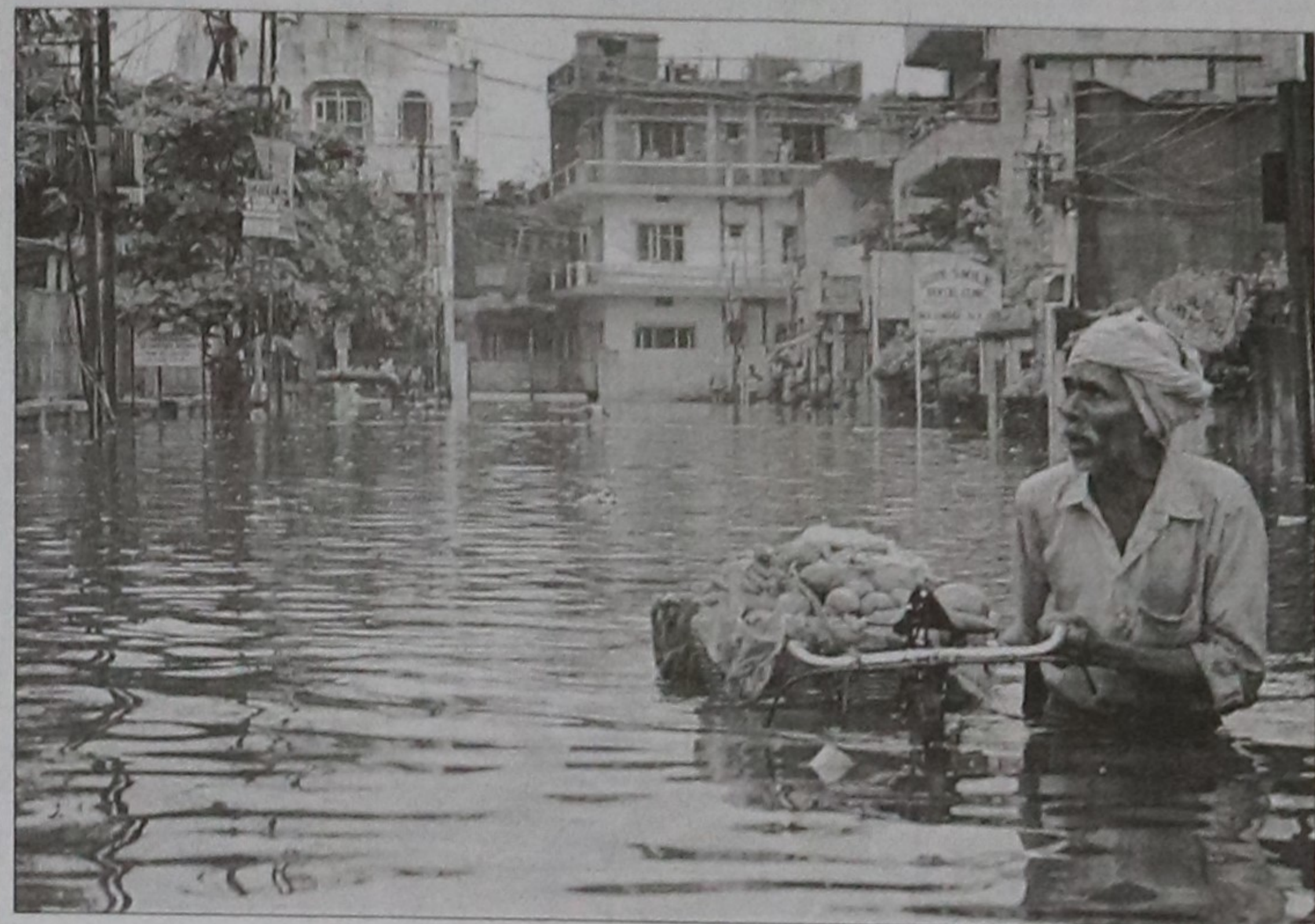
An Indian vendor pushes his fruit-laden bicycle along a flooded street in Patna yesterday. Areas of the Indian state of Bihar are experiencing floods after several days of continuous monsoon rain.

sion of forming and dissolving a government through a simple majority last week. Meanwhile, Nepal's first president could be chosen later this week with the country's Maoists and other parties reporting some progress in ending a post-monarchy deadlock, officials said Tuesday.