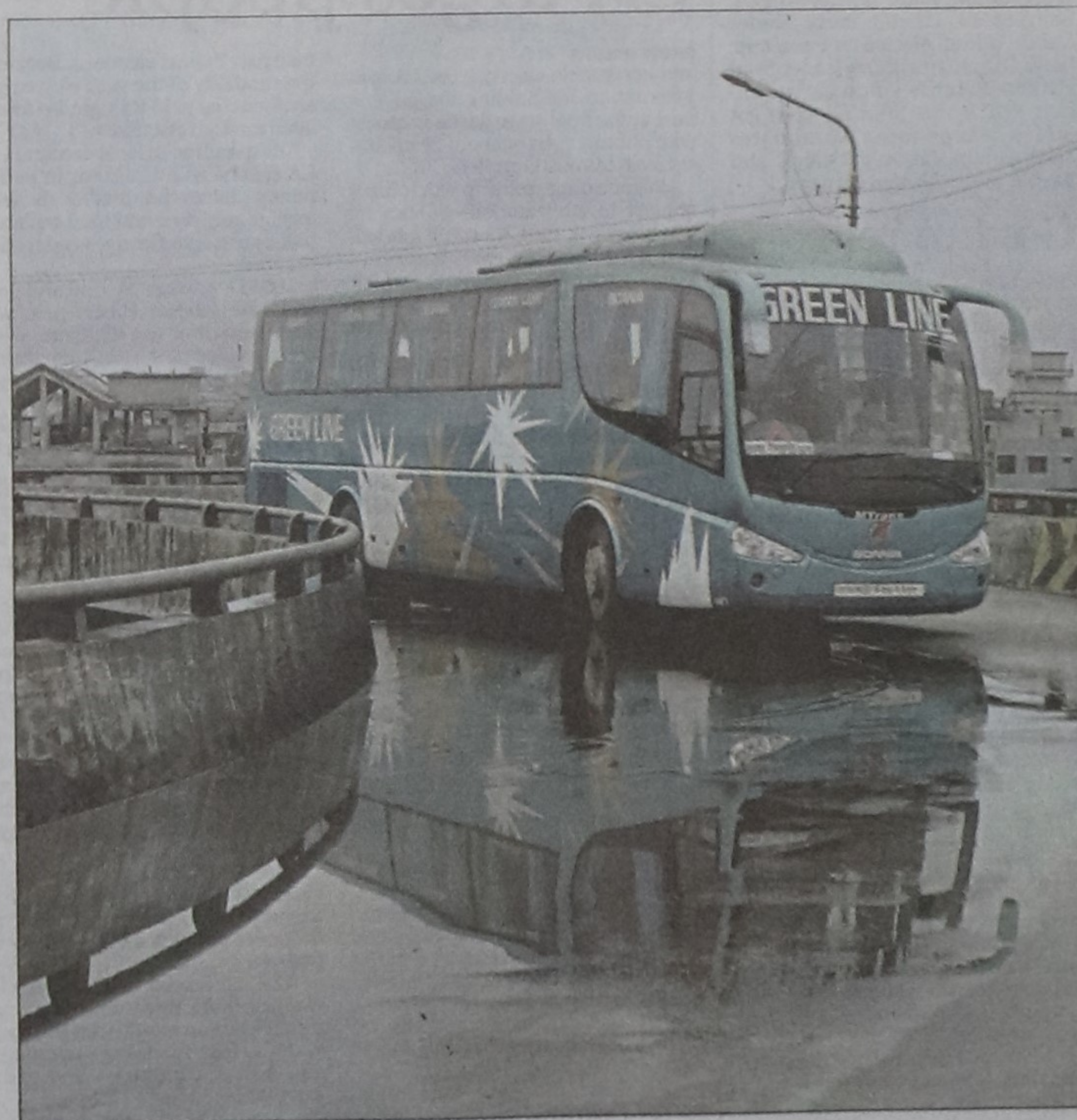
Clogged rainwater drainage system leaves Khilgaon flyover in the capital with puddles on the curves. The photo was taken yesterday.