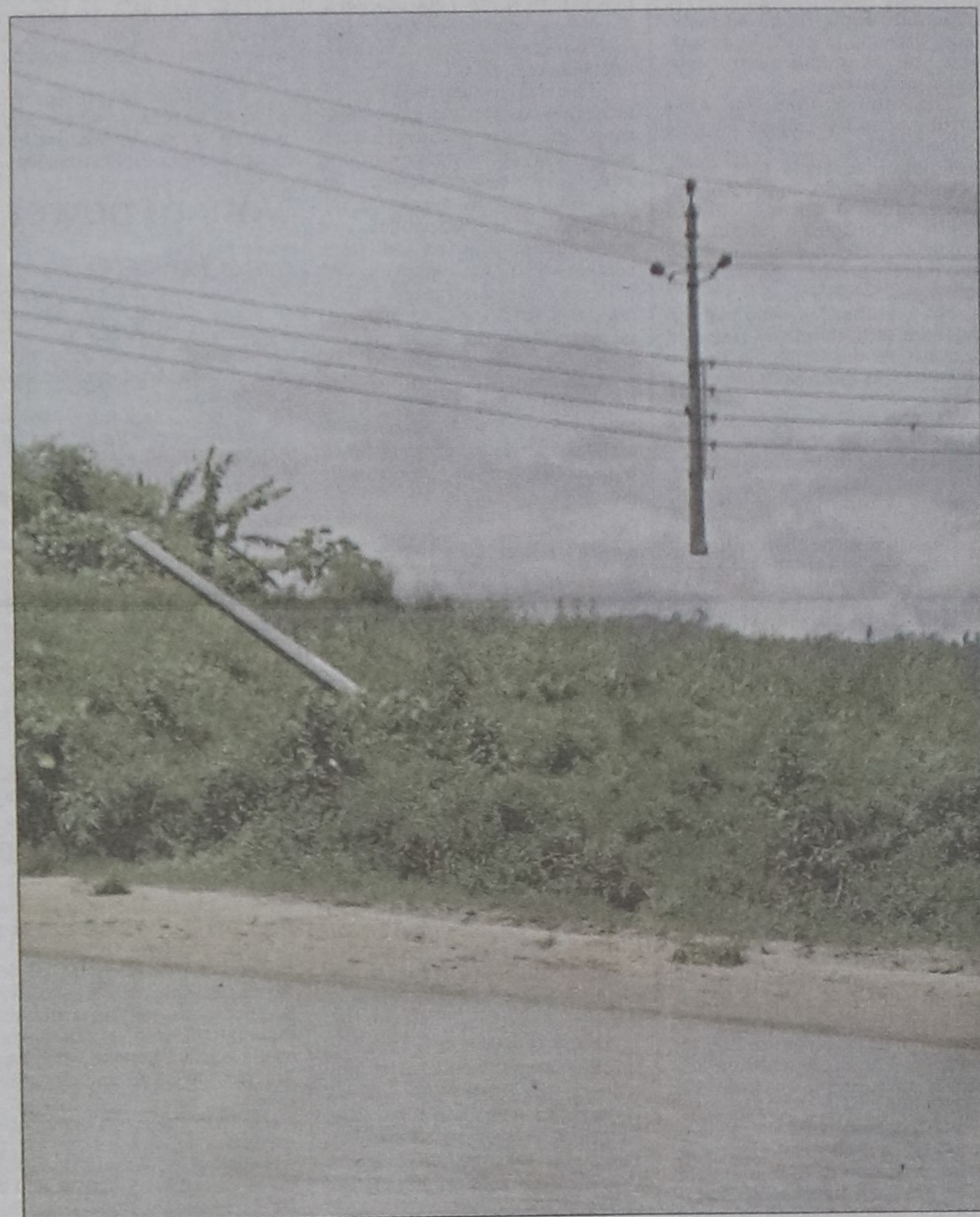
This electric pole has been in this state for over a year at Bat Tali of Khagrachhari district as power Development Board ignores risk of having high-voltage power lines hanging.