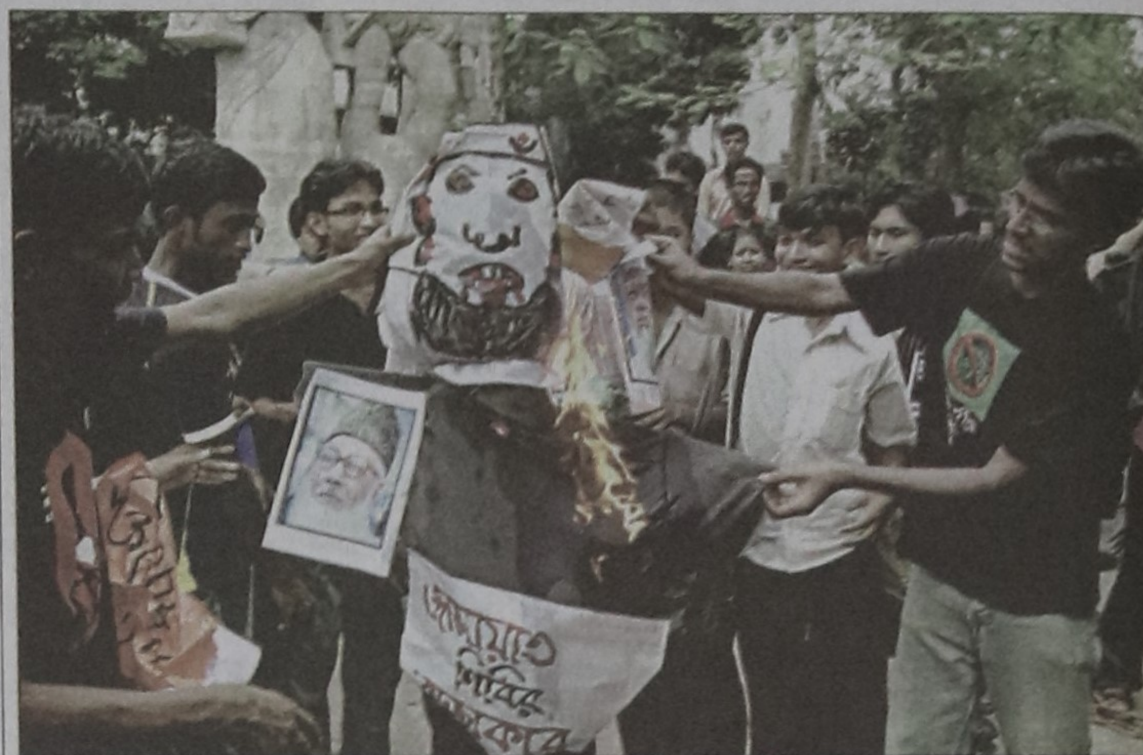
Dhaka University students yesterday burn effigies of Jamaat leaders Golam Azam, Motiur Rahman Nizami, Ali Ahsan M. Mojahid and Quader Mollah on the campus protesting the Jamaat-Shibir attack on a freedom fighter Friday. Story on page 3.