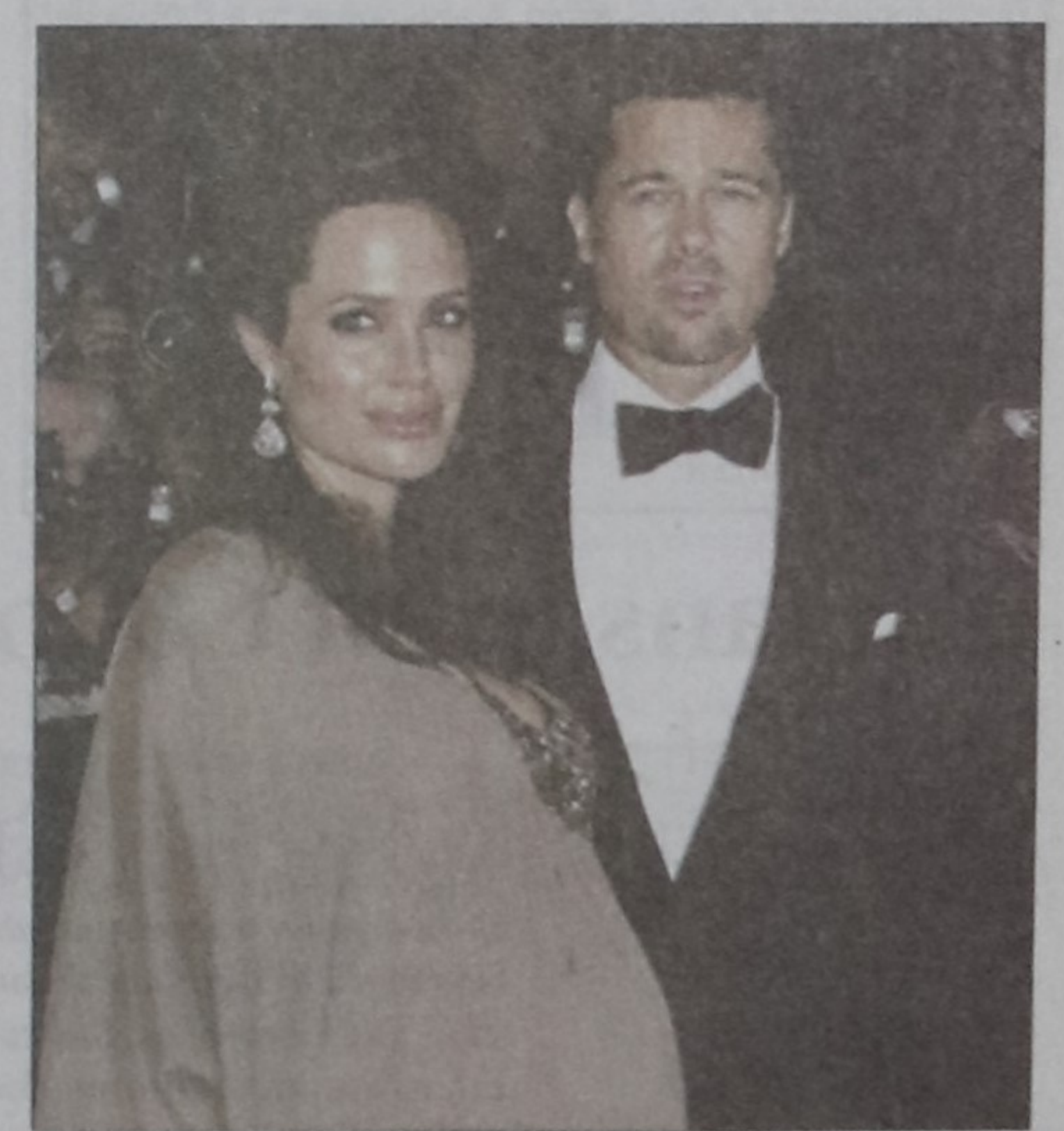
Angelina Jolie and Brad Pitt

"I congratulate the happy parents, the most famous couple in