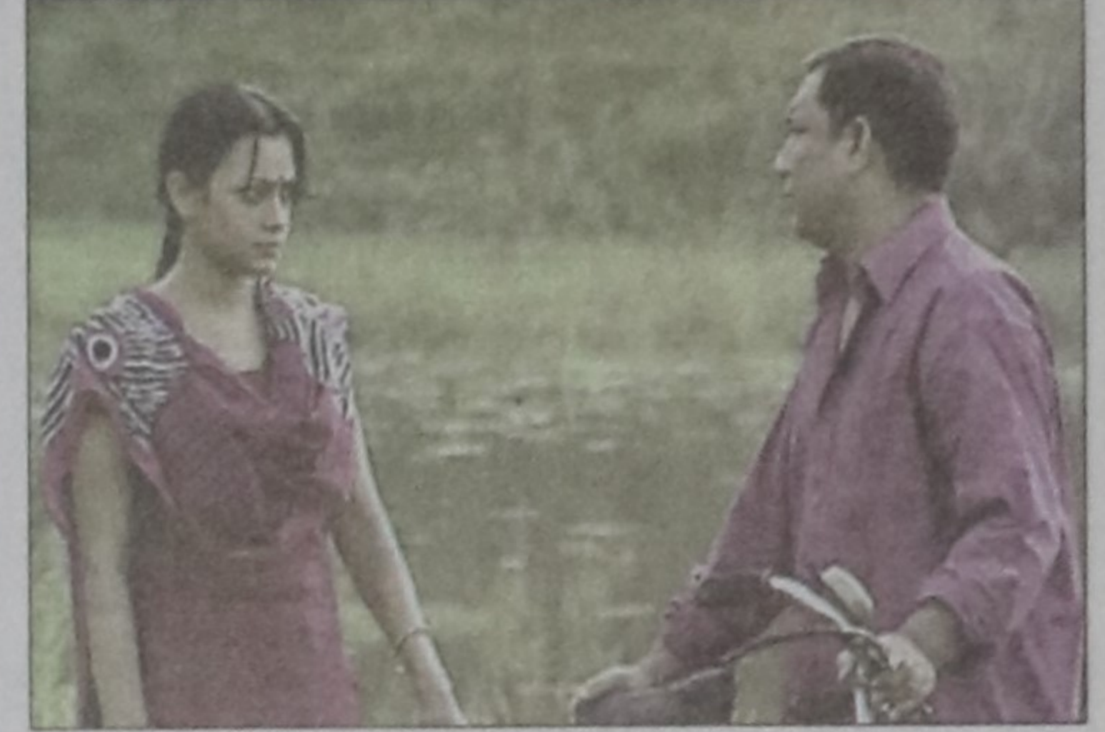
A scene from the play Look-alike