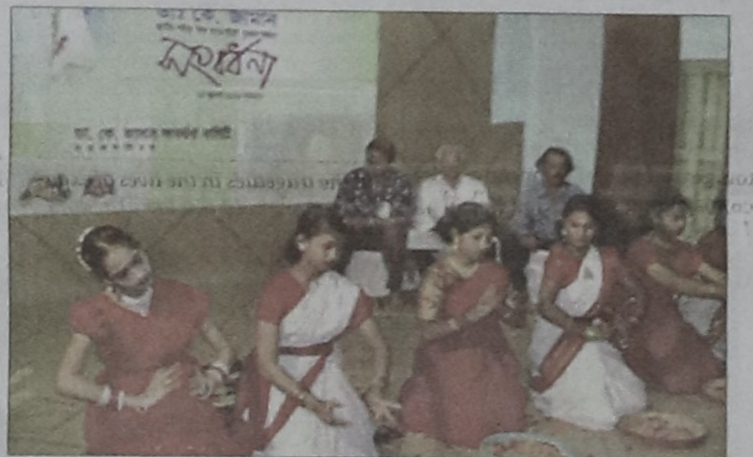
Child artistes perform at the programme

He has visited many countries and received many prizes for his lifelong contribution to the society. Among his recent laurels is an award by the Swami Swarupananda Foundation of Biswa Dharma Tatta Department, Dhaka University.