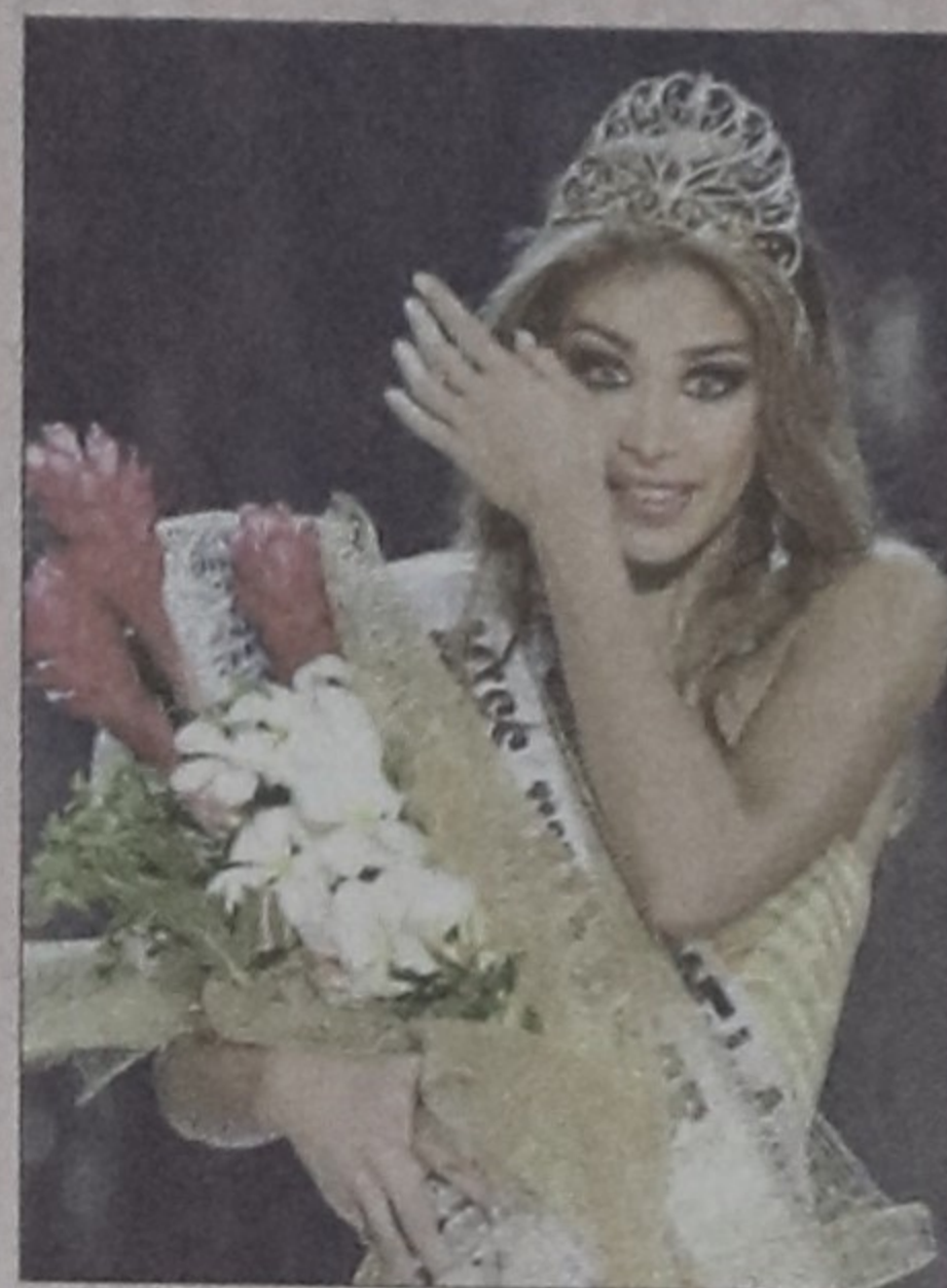
Miss Universe 2008 Dayana Mendoza