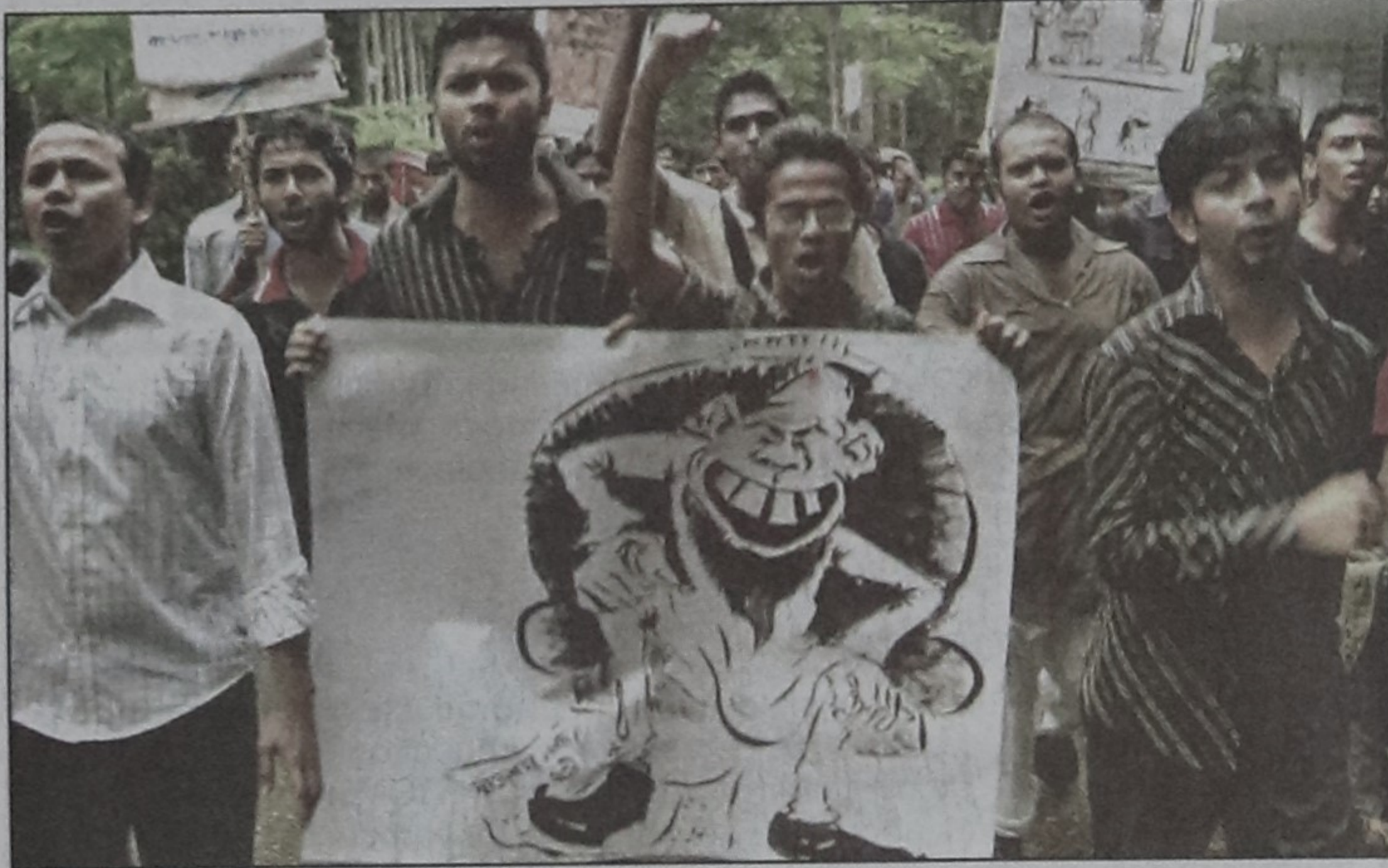
Bangladesh Chhatra Union stages a demonstration on the Dhaka University campus yesterday demanding exemplary punishment to the Shibir cadres involved in the attack on a freedom fighter.

Meanwhile, Bangladesh Chhatra Union (BCU), a left-leaning student organisation, also staged a demonstration on the campus demanding exemplary punishment to the Shibir cadres involved in the attack on the freedom fighter.