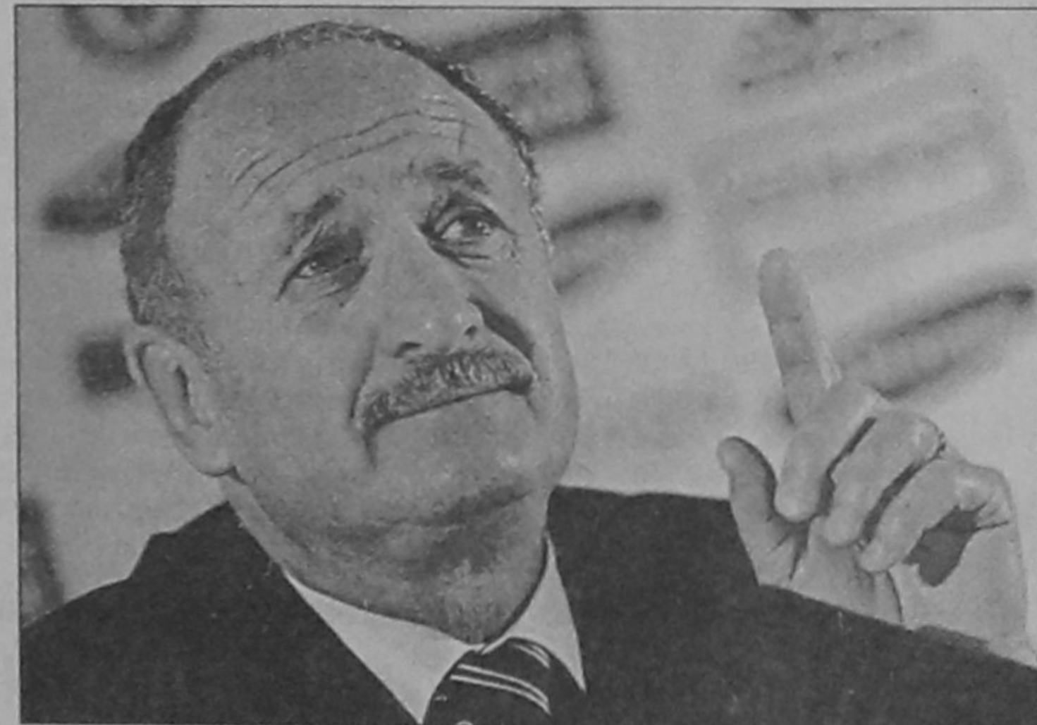
LUIZ FELIPE SCOLARI

back-to-back Premier League titles during his stint with the Blues but failed to capture the Champions League, while Grant got to the final of the competition before losing to Manchester United on penalties.