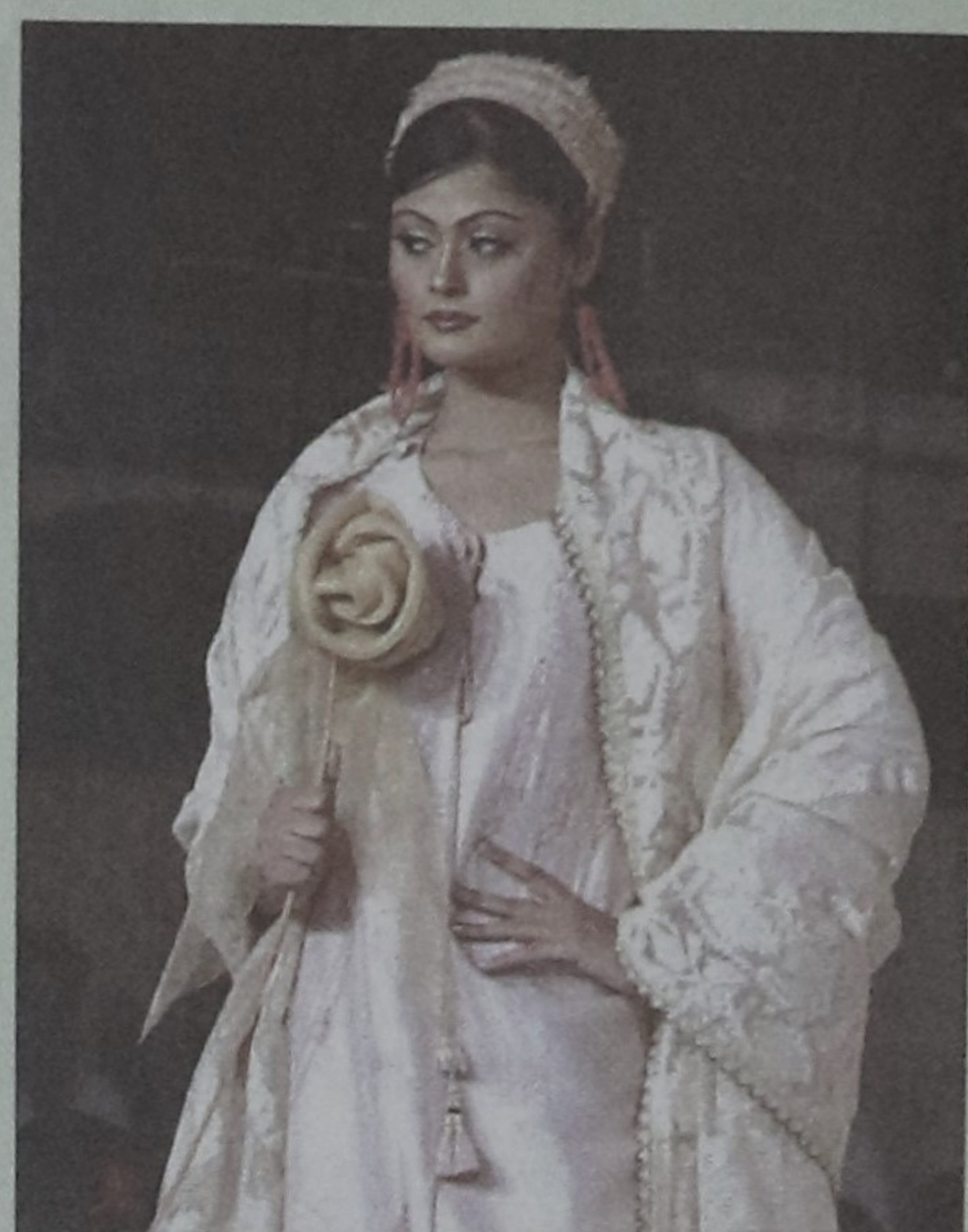
Models in dazzling ethnic wear and subtle pink matched with ravishing, ivory dupatta by designer Maheen Khan on the concluding ceremony of Aromatic Gold Dhaka Fashion 2008.