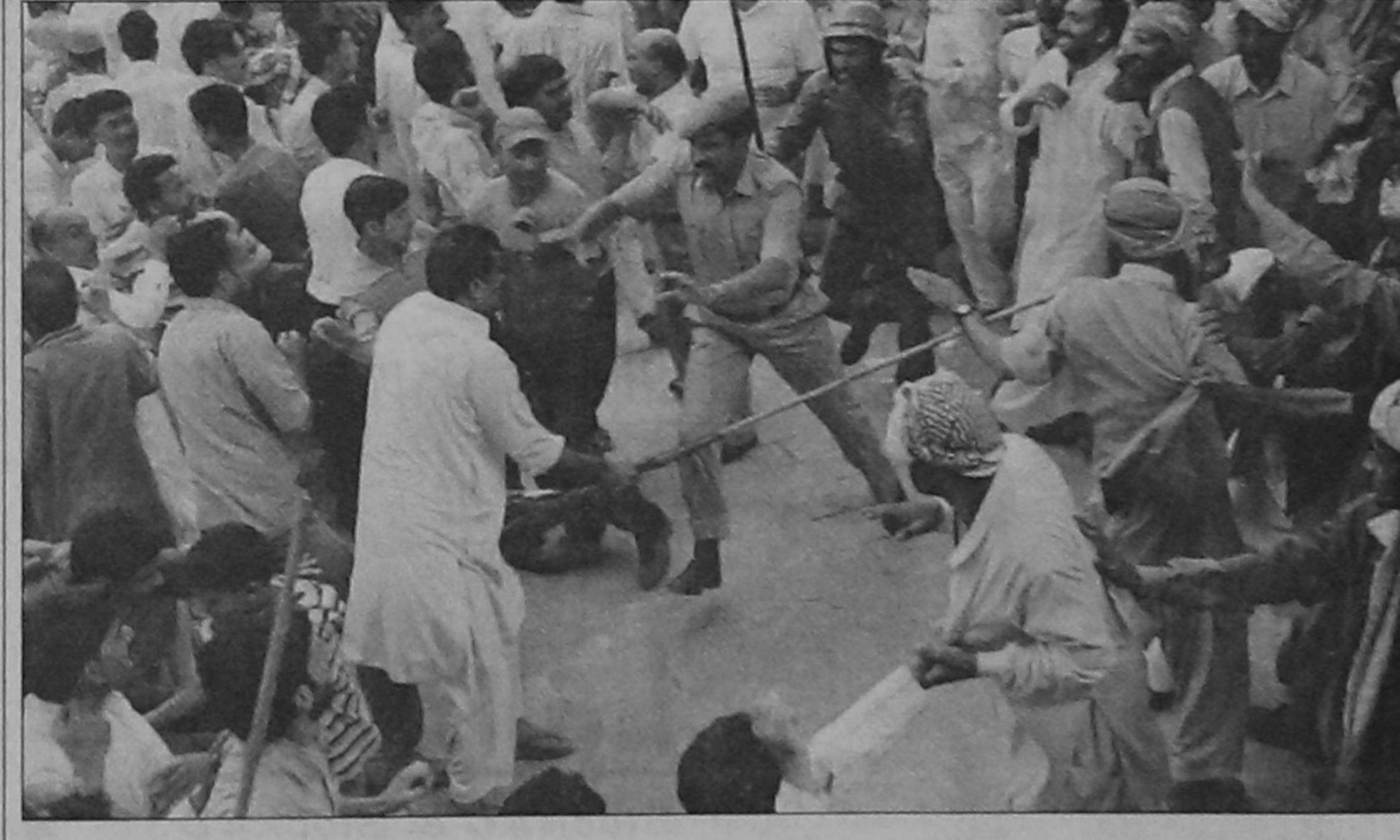
Police intervene as supporters of Kashmiri separatists clash with pro-India activists following a ceremony at a graveyard in Srinagar yesterday to honour 23 Muslims slain in 1931 by the forces of the Himalayan states former ruler Hari Singh.

away. Basically they are taking the steps that are needed to develop their medium range and intermediate capabilities in order to get to that stage," he said.