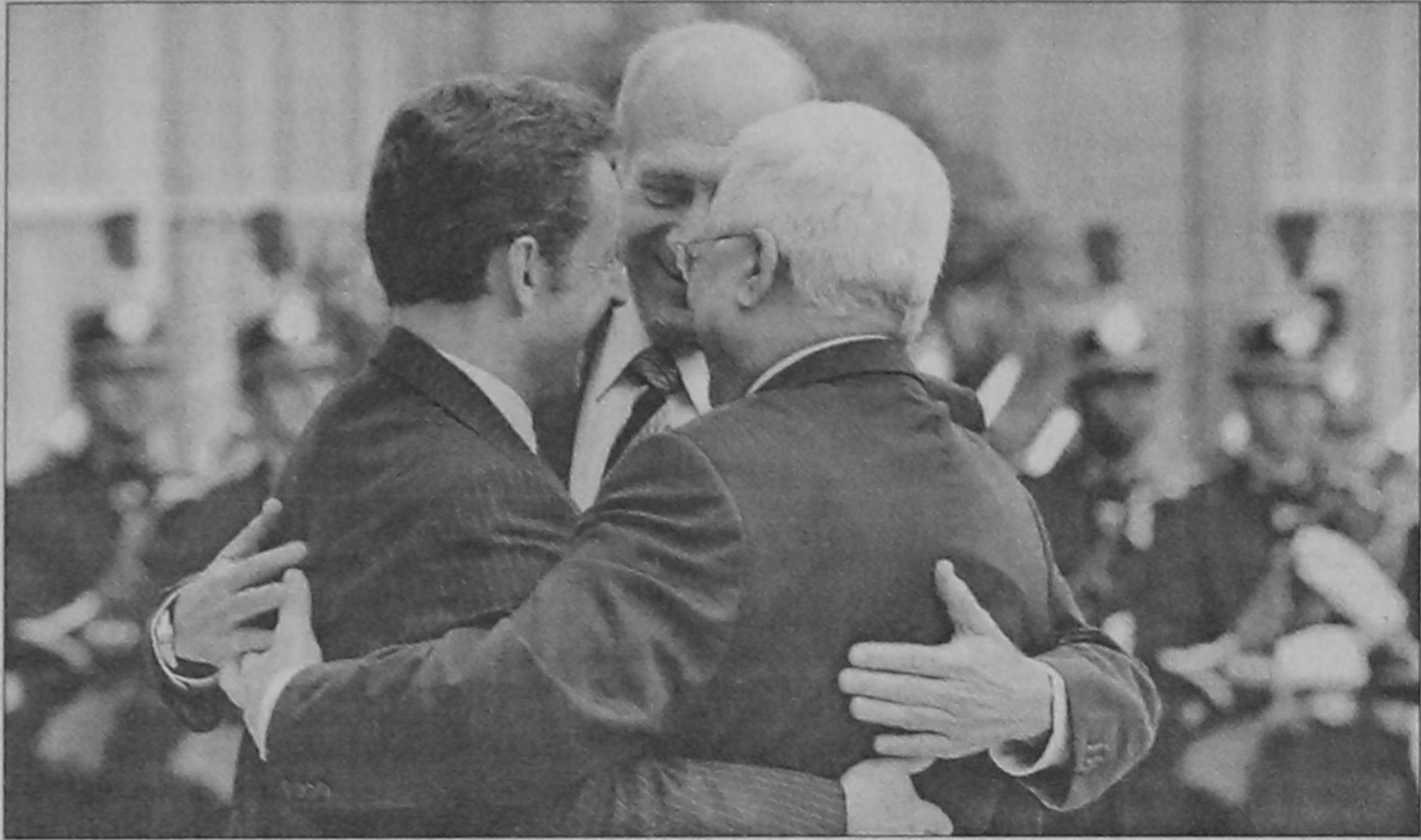
French President Nicolas Sarkozy (L) welcomes Palestinian Authority President Mahmoud Abbas (foreground) and Israeli Prime Minister Ehud Olmert at the Elysee palace yesterday in Paris, prior to the founding summit of the Union for the Mediterranean.

about dates," acknowledged one US official close to the negotiations, according to The Post. Iraqi political leaders "are all telling us the same thing... Iraqis want to know that foreign troops are not going to be here forever," the official was quoted as saying.