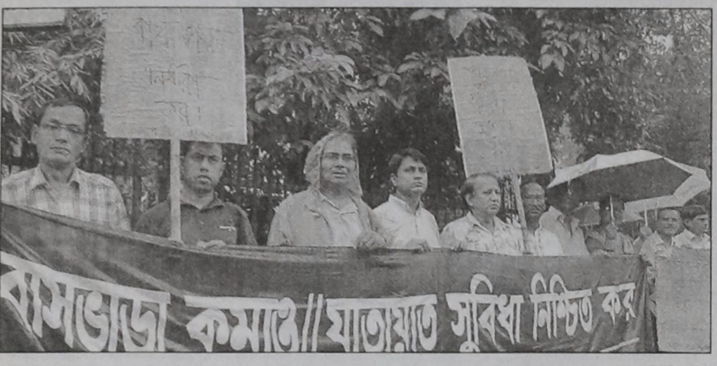
Paribesh Bachao Andolon (Save the Environment Movement) forms a human chain at Shahabag in the city yesterday demanding slash in bus fare.