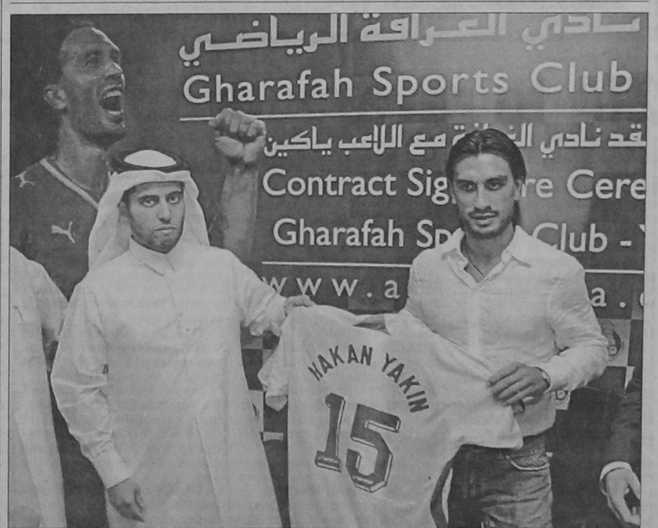
Swiss midfielder Hakan Yakin poses with his new jersey after signing a contract with Qatari League's Al-Gharrafa club in Doha on Friday.

becomes more complicated. But playing for Italy is a pleasure and an honour. It's unique." Cannavaro, who is recuperating from his pre-Euro 2008 knee injury, doesn't expect Lippi to radically change the Italy line-up, though is aware that a number of Gianluigi Casiraghi's under-21 team will start to establish themselves in the senior squad. Defender Giorgio Chiellini has led the way, the Juventus defender filling in for Cannavaro in Austria and Switzerland and is likely to be Cannavaro's partner in central defence when he returns to action. "It's true that my generation are starting to lose little things and that it is time to think about the future," he said. "Giuseppe, who I see in Spain (for Villarreal), is excellent and there is Aquilani (Alberto). They only need a bit of experience."