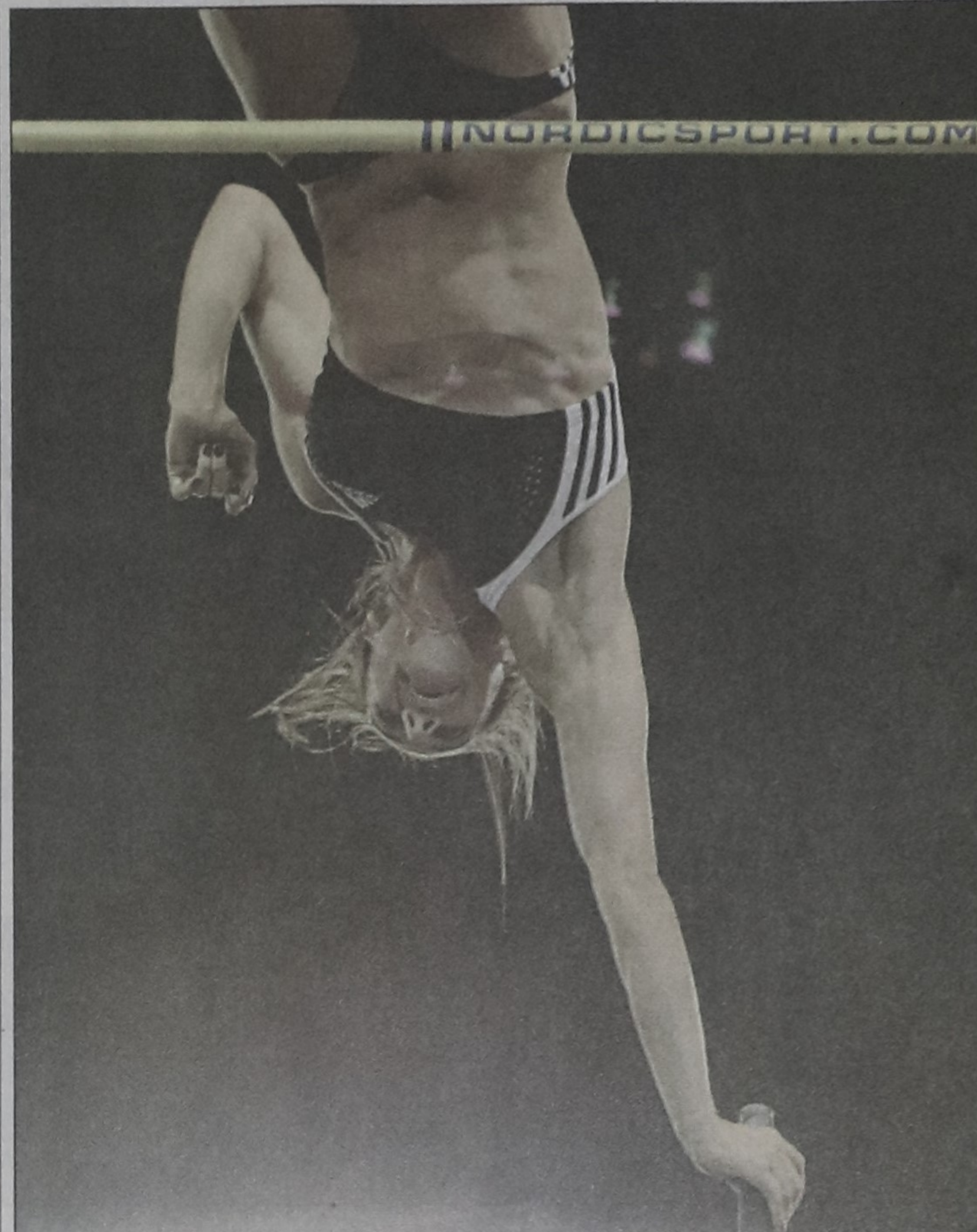
SKY IS THE LIMIT: Russian pole vault queen Yelena Isinbayeva just clears 5.03 metres, a new world record in women's pole vault, during the Athletics Golden Gala at Rome's Olympic Stadium on Friday.

The participating teams would sit Monday and finalise a suitable date for the tournament.