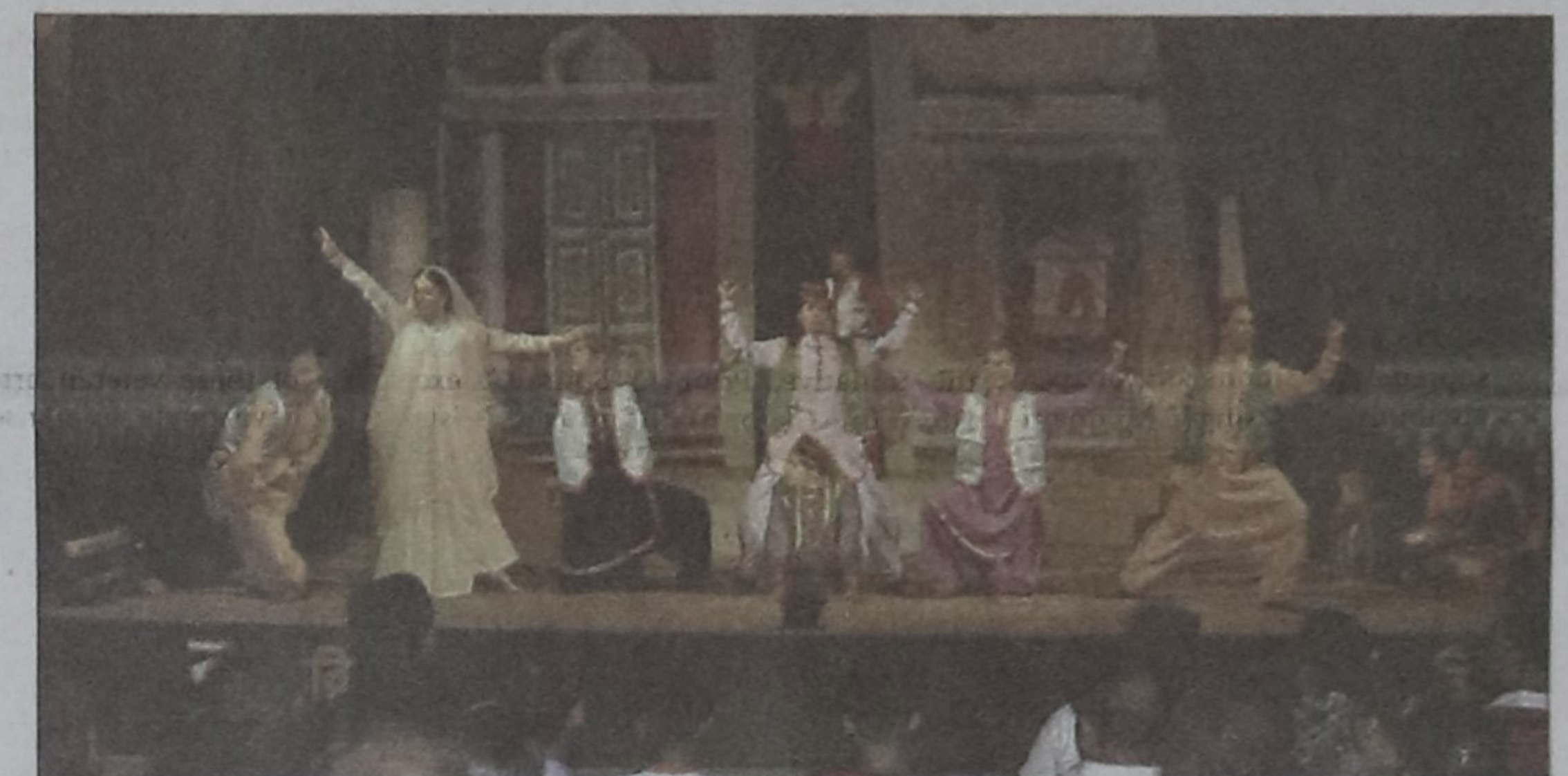
A scene from Khandani Kissa