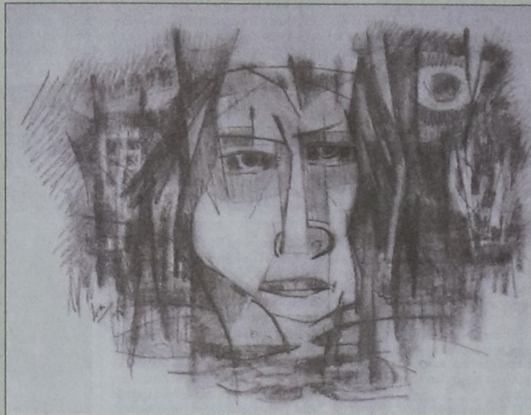
One of Safiuddin's artworks