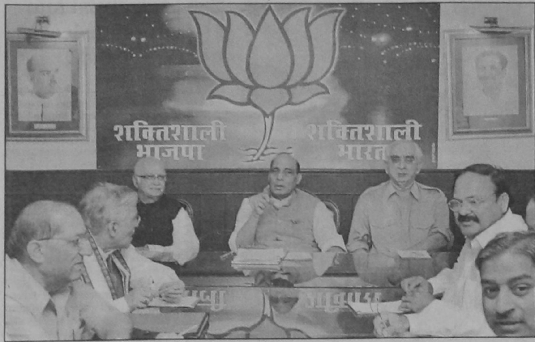
India's opposition Bharatiya Janta Party (BJP) President Rajnath Singh (C) gestures while addressing the Central Election committee meeting in New Delhi yesterday as LK Advani (3L) and other leaders look on. Senior BJP leaders met to decide the second list of the party's Lok Sabha - Lower House - candidates.