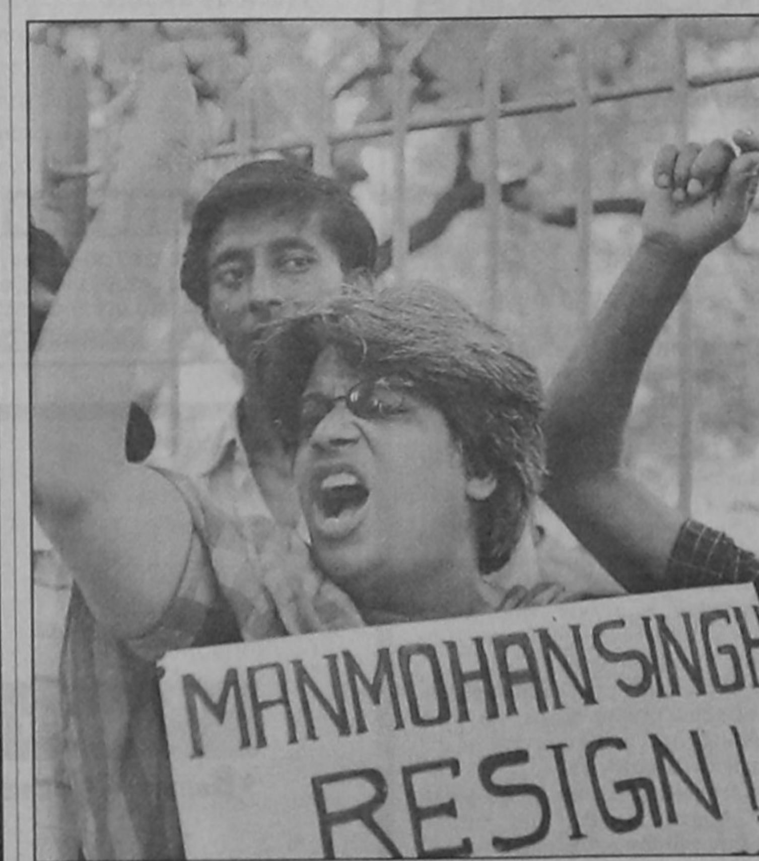
Activists from Communist Party of India-Marxist Leninist (CPM-L) New Democracy shout slogans against Congress-led UPA government during a protest over Indo-US nuclear deal and demanded resignation of Indian Prime Minister Manmohan Singh in New Delhi yesterday.

Chatterjee's Lok Sabha office issued a press release earlier in the week saying that the Speaker didn't want any speculation on his quitting office.