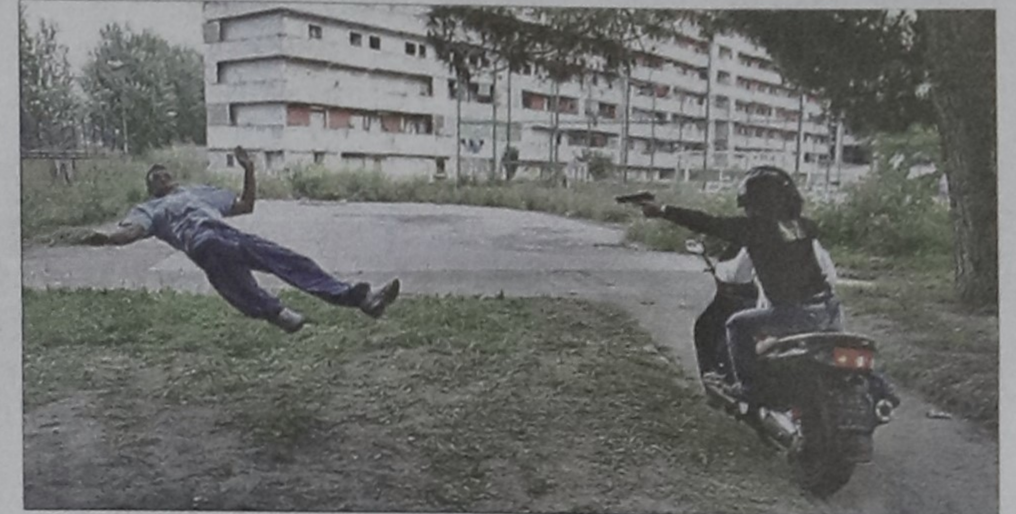
A scene from "Gomorrah," winner of the grand prix at Cannes

The Cannes awards have also stoked the never-ending debate on the Italian model of