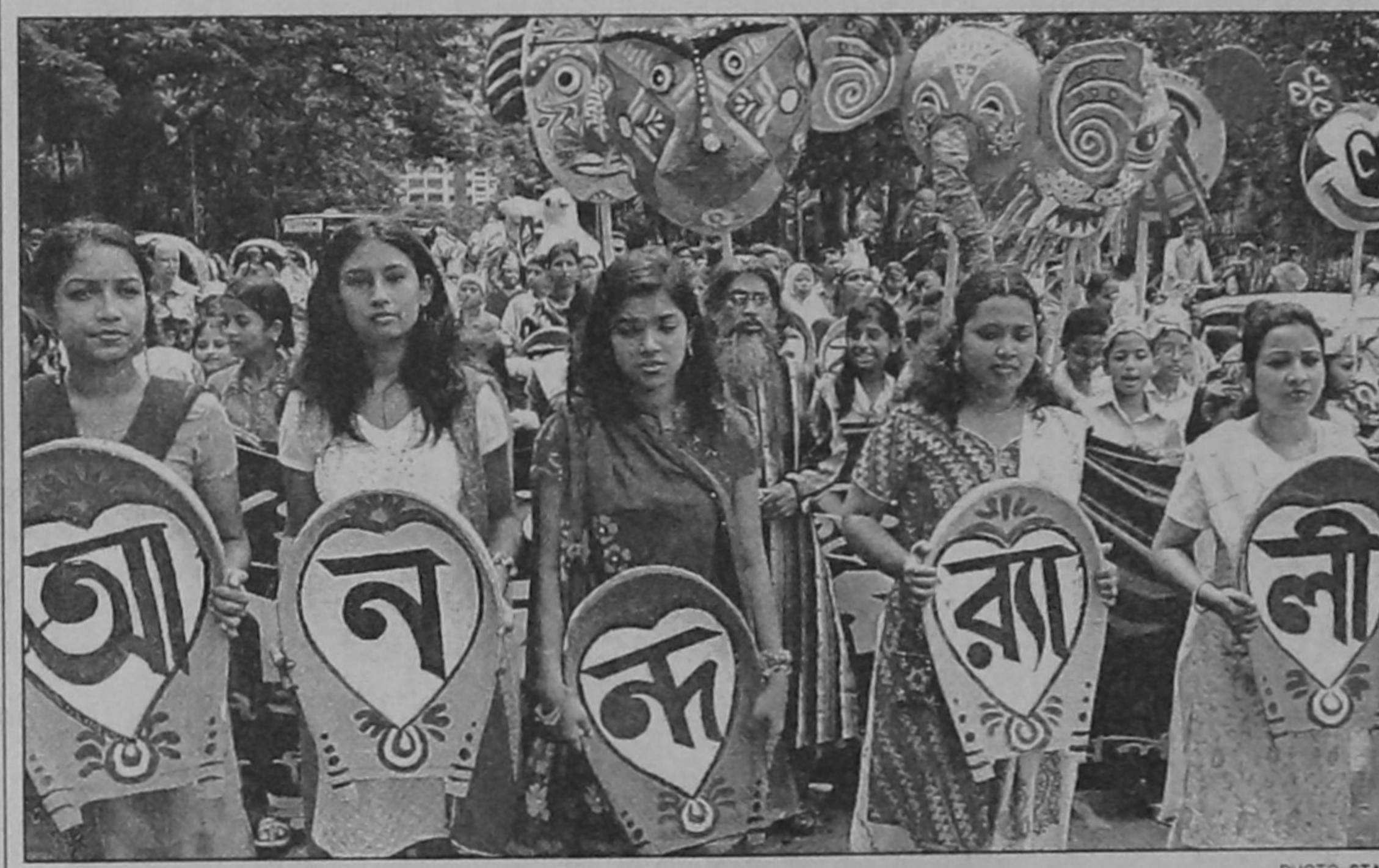
Gendaria Kishalay Kachi Kanchar Mela brings out a colourful procession at Muktagan in the city yesterday to celebrate its founding anniversary.

STAFF CORRESPONDENT An iron factory worker died at a city hospital yesterday seven days after he was beaten up by his fellow worker.