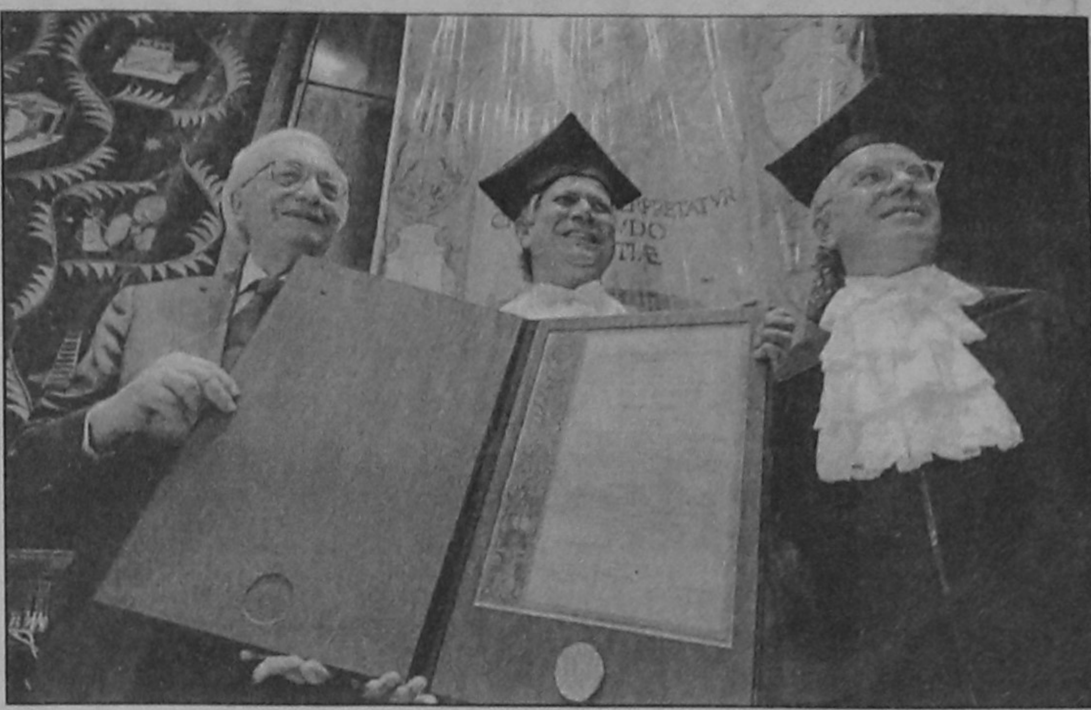
Sapienza University of Rome conferred honorary doctorate degree on Nobel laureate Prof Muhammad Yunus in Rome recently.

Jatiyatabadi Chhatra Dal (JCD), angered by a newspaper report against them, again harassed some students of Suriya Sen Hall of Dhaka University last night. On Wednesday night, they had harassed some 25 students of the hall, the report of which was published in different dailies.