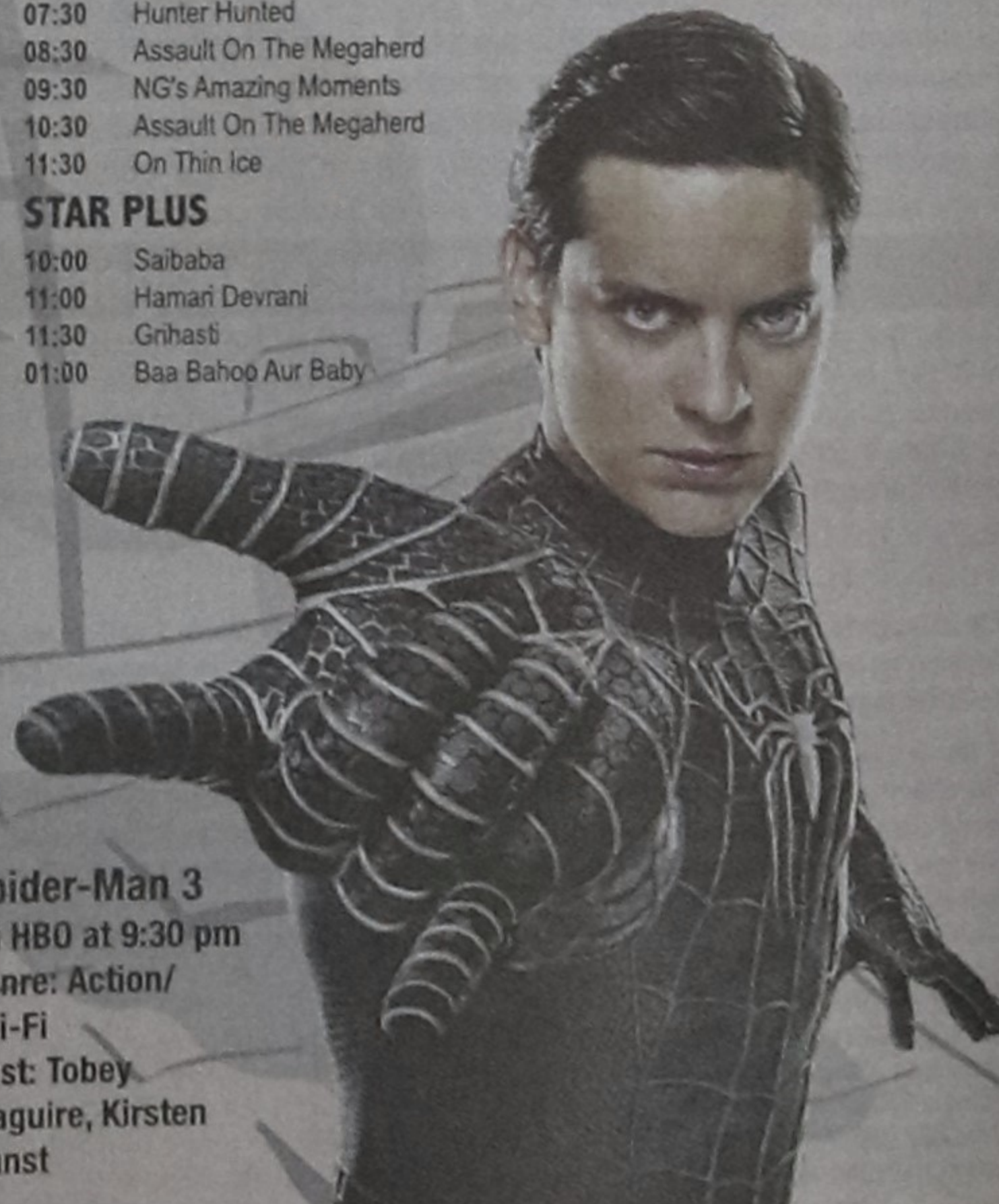
Spider-Man 3 On HBO at 9:30 pm Genre: Action/Sci-Fi Cast: Tobey Maguire, Kirsten Dunst