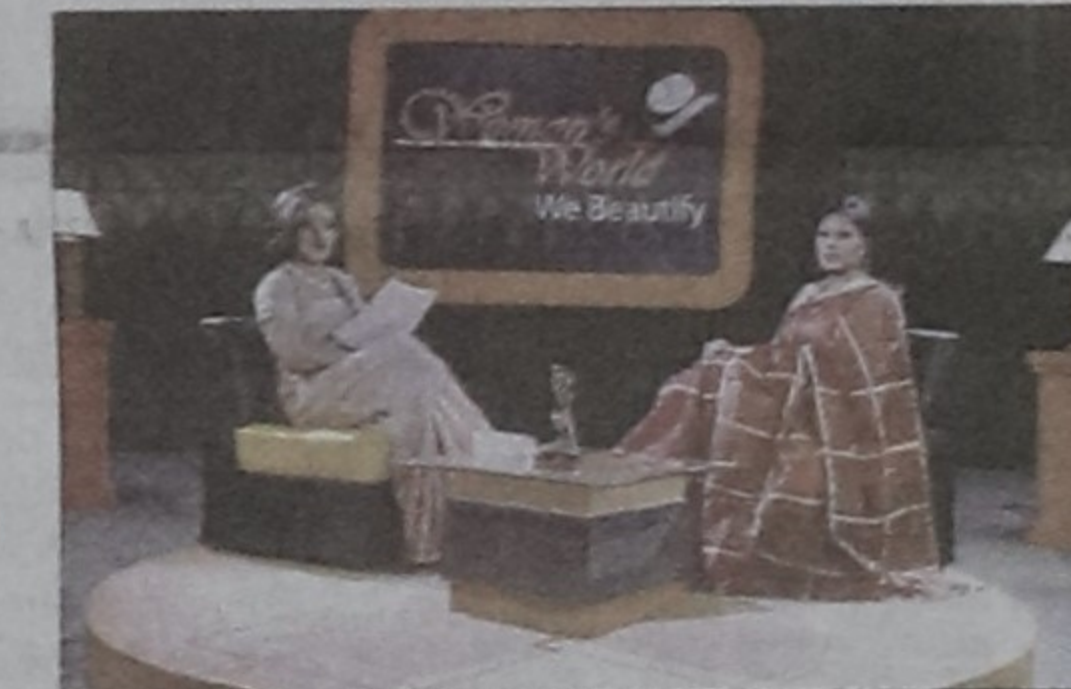
A scene from the show