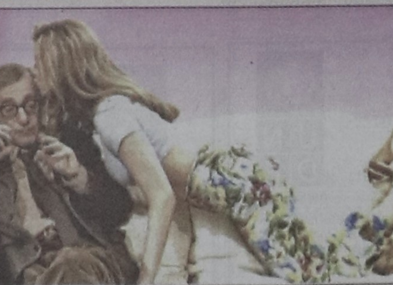
Mighty Aphrodite On Zee Studio at 6:00 pm Genre: Comedy Cast: Mira Sorvino, Woody Allen