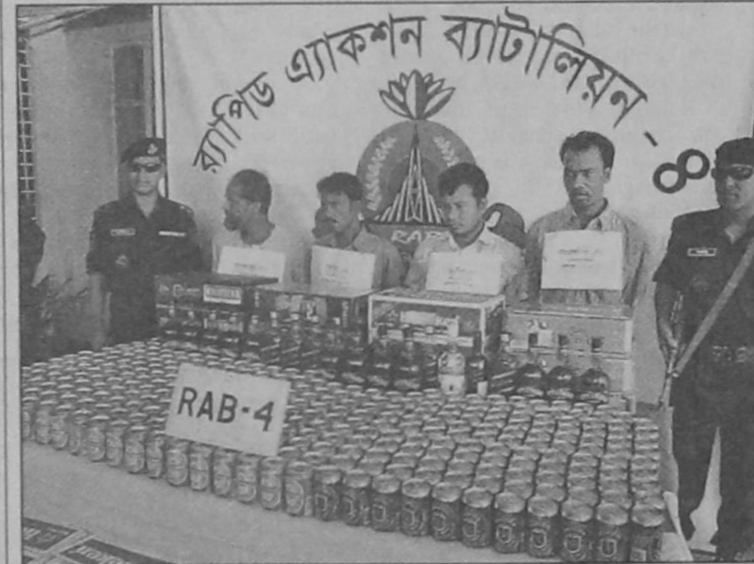
Members of the Rapid Action Battalion (Rab) seize huge quantity of liquor and arrest four persons in this connection from New DHOS area in the city on Tuesday night.