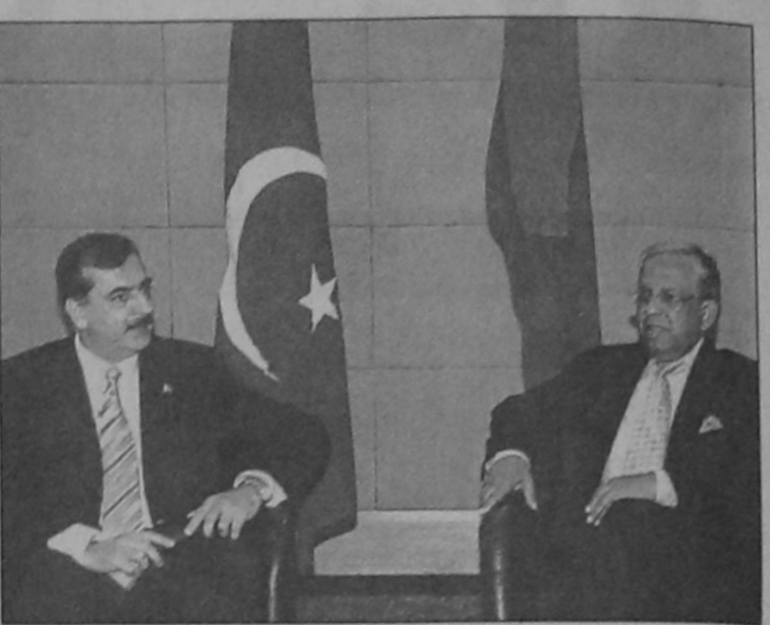
Members of Rapid Action Battalion (Rab) arrested three robbers while making away with looted old ornaments and other valuables in the port city's Patenga area yesterday morning.

Chief Adviser Fakhruddin Ahmed's active participation in the D-8 Summit in Kuala Lumpur boosted Bangladesh's international profile as a 'thought leader'.