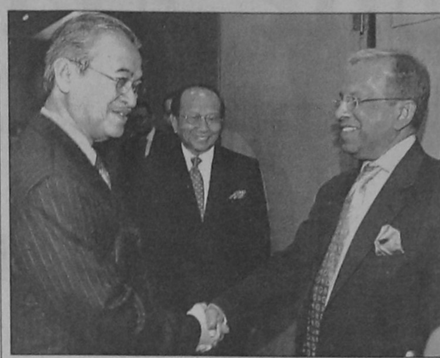
Chief Adviser Fakhruddin Ahmed meets Malaysian Prime Minister Abdullah Bin Ahmad Badawi, left, and Pakistani Prime Minister Yousaf Raza Gilani, right, separately at Hilton Hotel in Kuala Lumpur on Tuesday.