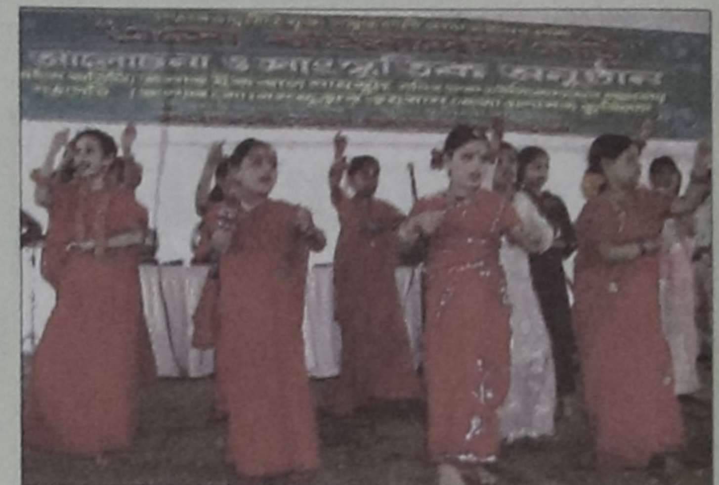
Child artistes perform at the programme