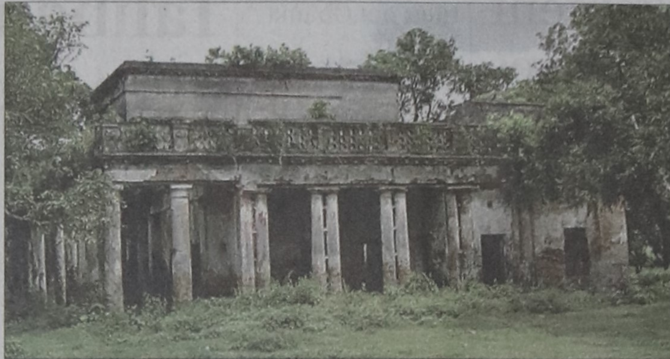
The dilapidated 'Neel Kuthi' in Jhenaidah (top), local activists form a human chain demanding restoration of the historic structure