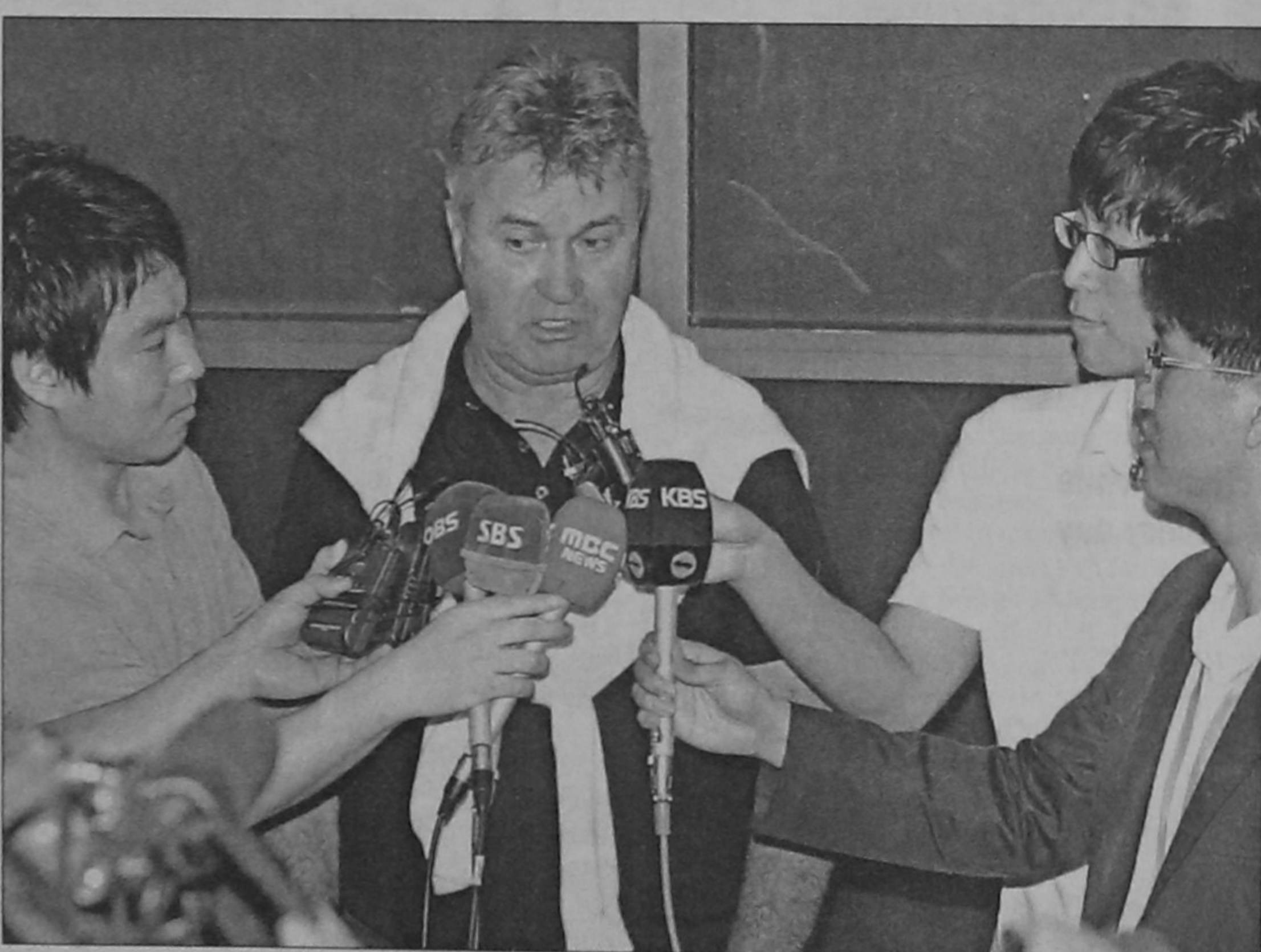
Russia football coach Guus Hiddink (C) talks to reporters upon his arrival at Incheon International Airport, west of Seoul on Monday. The Dutch tallman, who recently led Russia into the semifinals of Euro 2008, arrived in Seoul to attend the formal opening of a football field he has helped to establish for disabled children during his stint with South Korea in 2002.

Atletico said meanwhile that it is in talks with several clubs which are interested in signing its Portugal international Maniche, 30, ended last season out on loan at Inter Milan after having fallen out with coach Javier Aguirre.