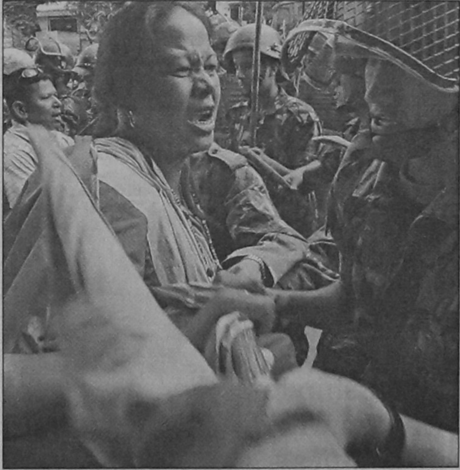
Protesters from Nepal's ethnic Tharu community clash with policemen as they stage a rally in Kathmandu yesterday against the "One Mahadesh, One State" demand made by the Mahadheshi people residing in the country's southern belt.

Singh's ruling Congress party successfully wooed its longtime arch-rival Samajwadi Party (SP), which holds 39 seats, into backing the deal. Such bargaining appears to have helped Singh's Congress party to outmanoeuvre the left, and to stage off elections ahead of the scheduled May 2009 date. Parties from the left are insisting the government tell them on Monday whether it plans to head to the International Atomic Energy Agency (IAEA) to finalise a safeguards agreement -- the next step in the process. But with its new partners on board, the Congress has scoffed at the ultimatum. The United States meanwhile has been pressing India to move on the deal before the end of Bush's tenure, warning that the pact may not survive in its current form under the next administration.