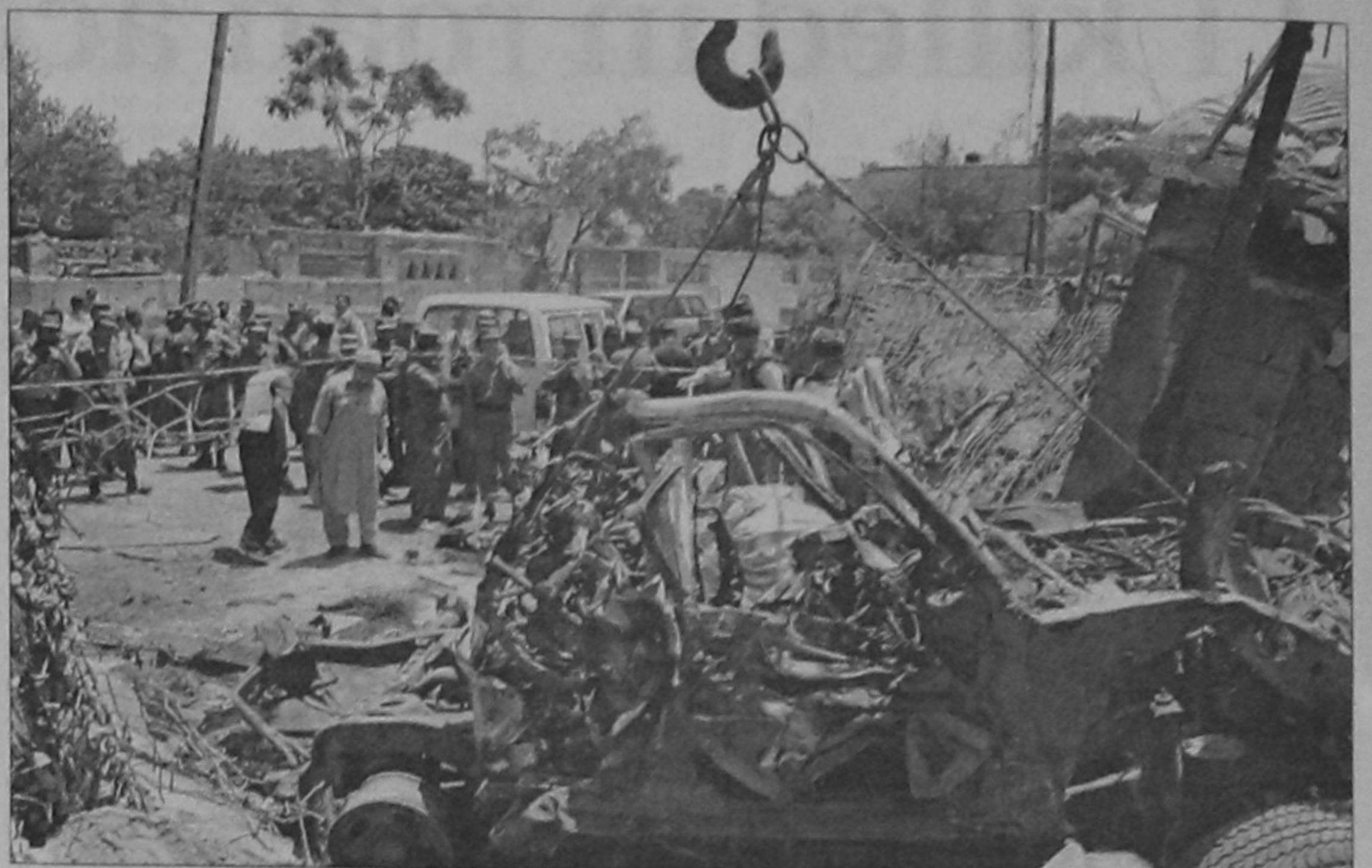
Afghan officials look on as a vehicle is moved from the site of a suicide attack in front of the Indian Embassy in Kabul yesterday. A suicide bomber rammed an explosives-filled car into the gates of the Indian embassy in Afghanistan, killing more than 40 people including four Indian nationals.

"This is against humanity," Gilani told reporters Monday after visiting some of the victims at an Islamabad hospital. "The law will take the culprits in its grip." Asif Ali Zardari, head of the main ruling party, insisted the attack would only strengthen the resolve of the government to confront the militants and extremists head on.