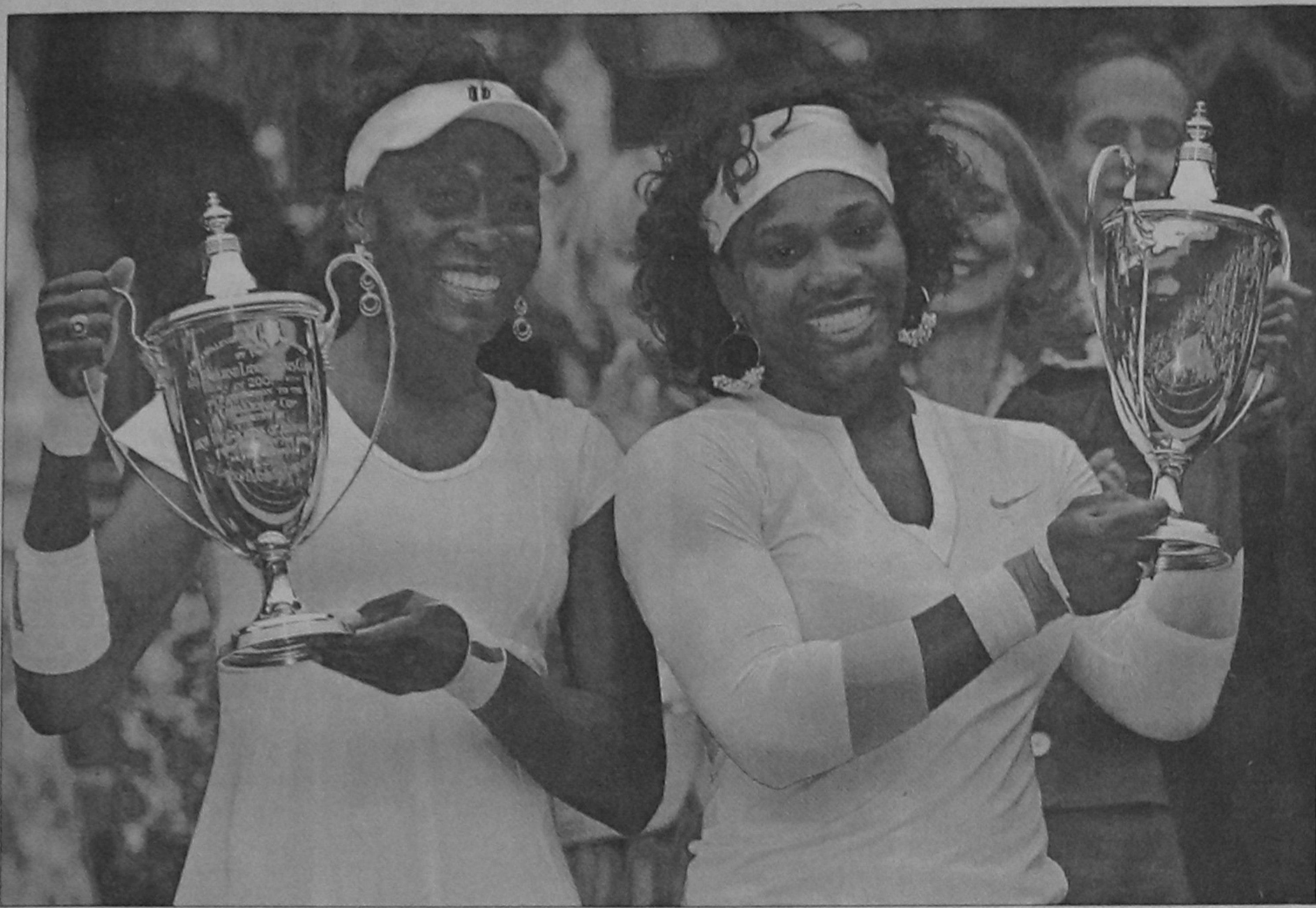
US stars Venus (L) and Serena Williams pose with their trophies after beating compatriot Lisa Raymond and Samantha Stosur of Australia in the Wimbledon Women's Doubles Final at the All England Tennis Club in London on Saturday.