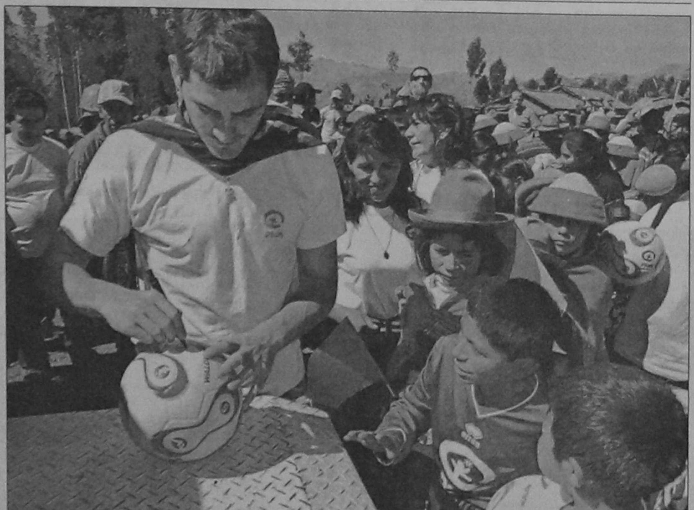
Spanish international goalkeeper Iker Casillas (L) autographs a ball at Patabamba community in Cusco, Peru on Saturday. Casillas supports an educational program of an international NGO in this place.

The two reserve stadiums Poland's Drzewiecki referred to were in Chorzow and Krakow, both in the south of the country.