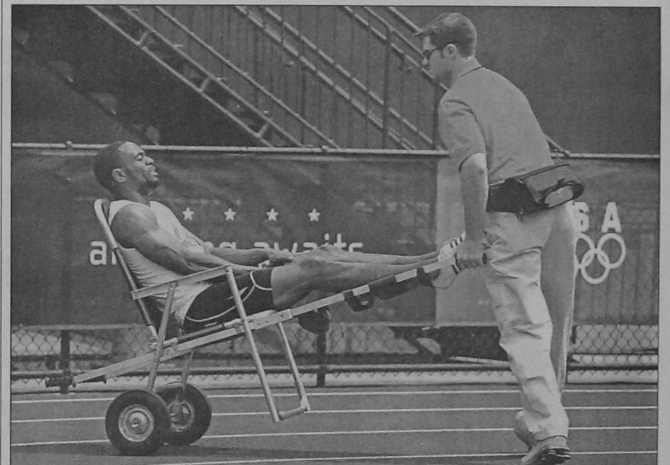
World champion Tyson Gay is helped off the track by medical staff after falling in pain during the men's 200-metre quarterfinals at the US Track and Field Olympic Trials at Hayward Field in Eugene on Saturday.

Quarterfinals in the hurdles and 200 semi-finals were to be staged later Saturday with finals in both set for Sunday. Finals later Saturday include the high jump, where 2004 Olympic champion Dwight Phillips bids for a Beijing trip.