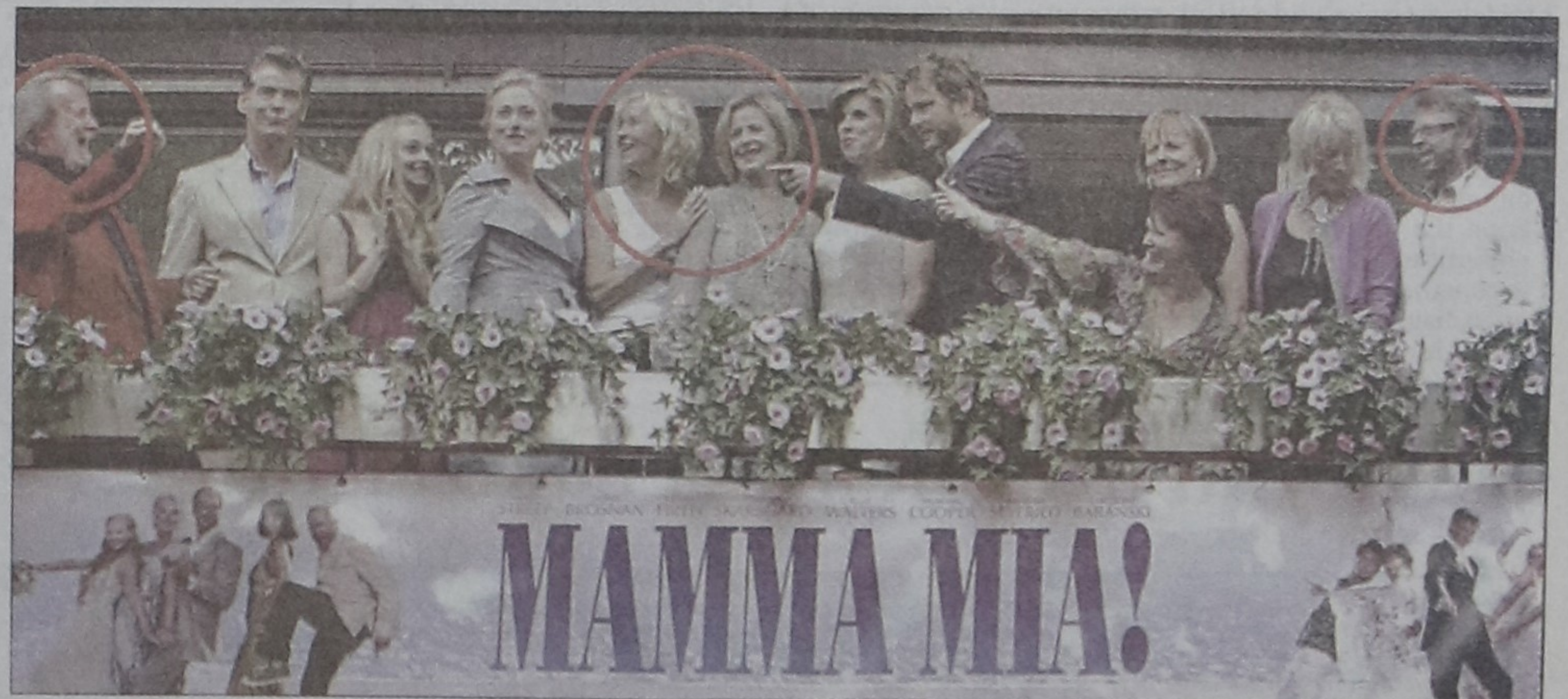
Circled from left to right are Abba's Benny Andersson, Agnetha Faltskog, Anni-Frid Lyngstad and Bjorn Ulvaeus

Pop supergroup Abba have reunited for the first time in 22 years for the premiere of hit musical Mamma Mia!