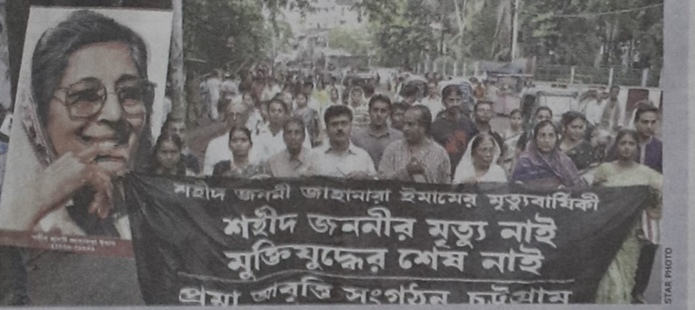
Cultural activists take out a procession in the port city on June 26 to mark the death anniversary of Shaheed Janani Jahanara Imam.