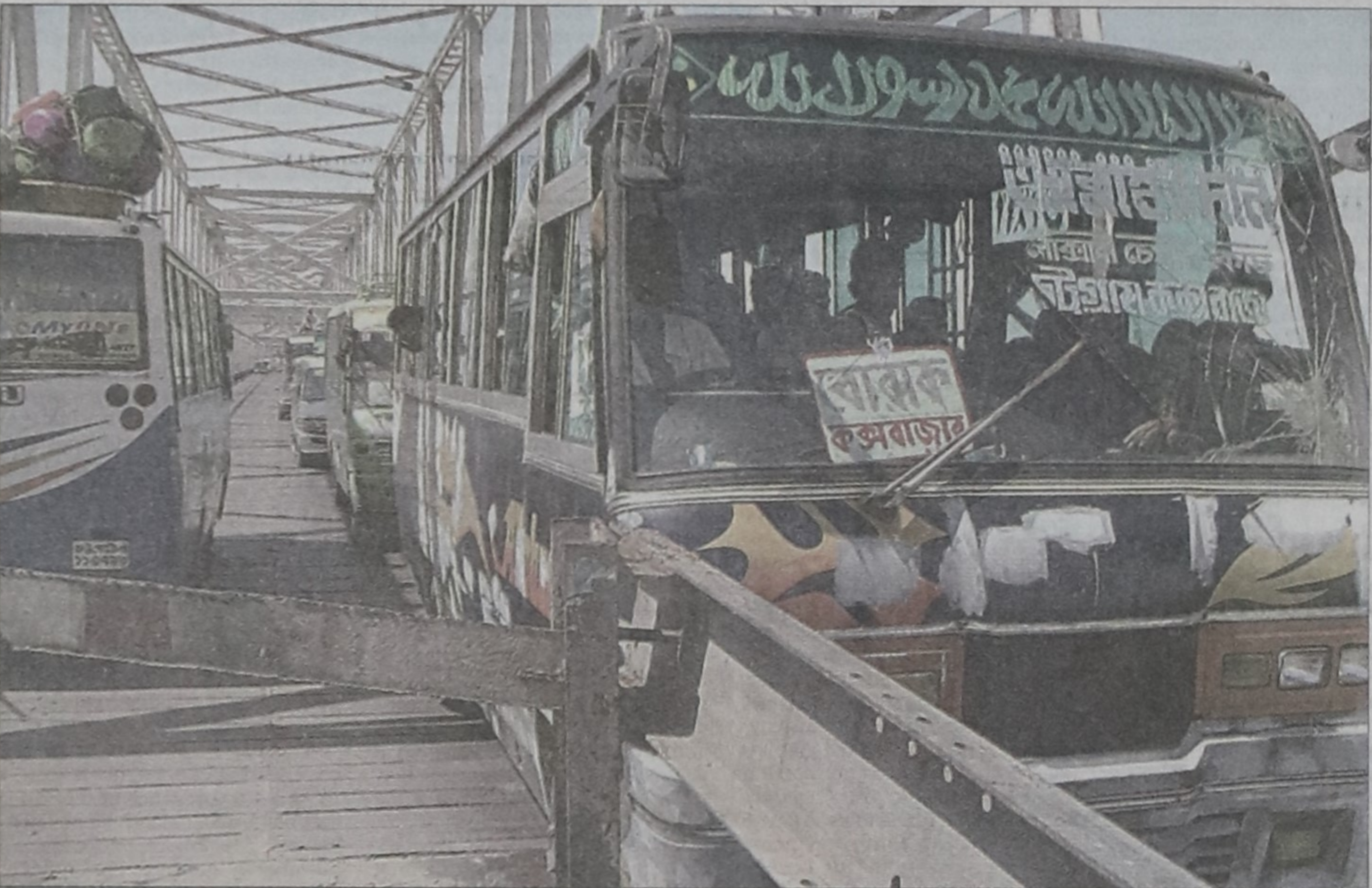
An iron fence has been erected on Shah Amanat Bridge in the port city to prevent heavy vehicles from crossing the bridge. But this also makes it difficult for minibuses to negotiate it, leading to tailback.

55 percent, an owner of 14 to 18 kathas will get 52.5 percent, and an owner of 18 to above 20 kathas will get 50 percent ground coverage, the sources at CDA said.