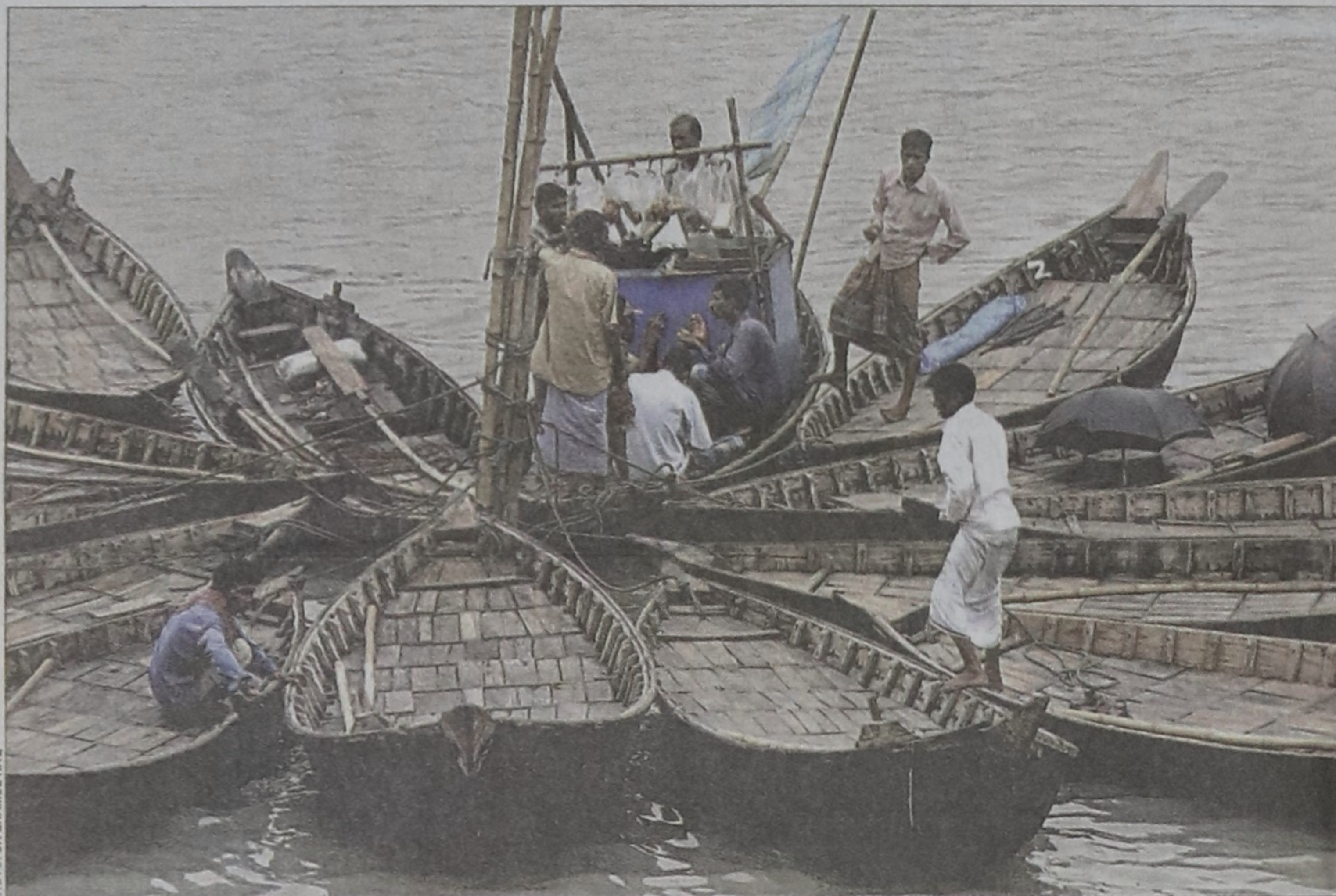
A vendor runs his tea stall on a boat on the Buriganga as the authorities do not allow them to crowd the riverside in the area. The picture was taken from Jinjira area.