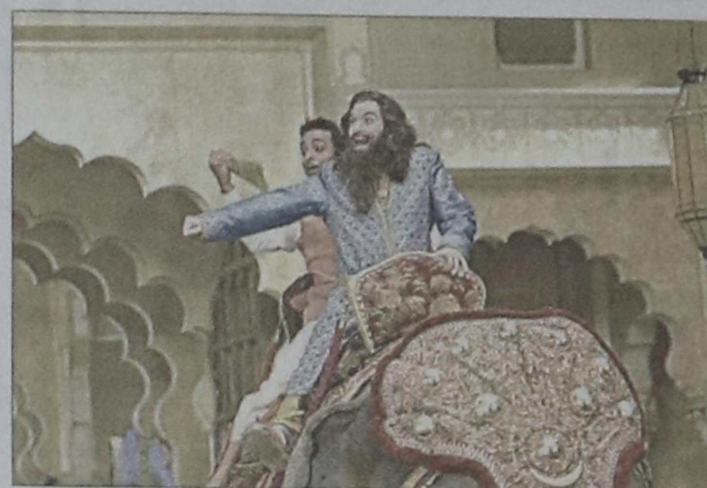
"The Love Guru" has drawn sharp criticism from some Hindus.

News outlets in India are avidly tracking complaints and protests