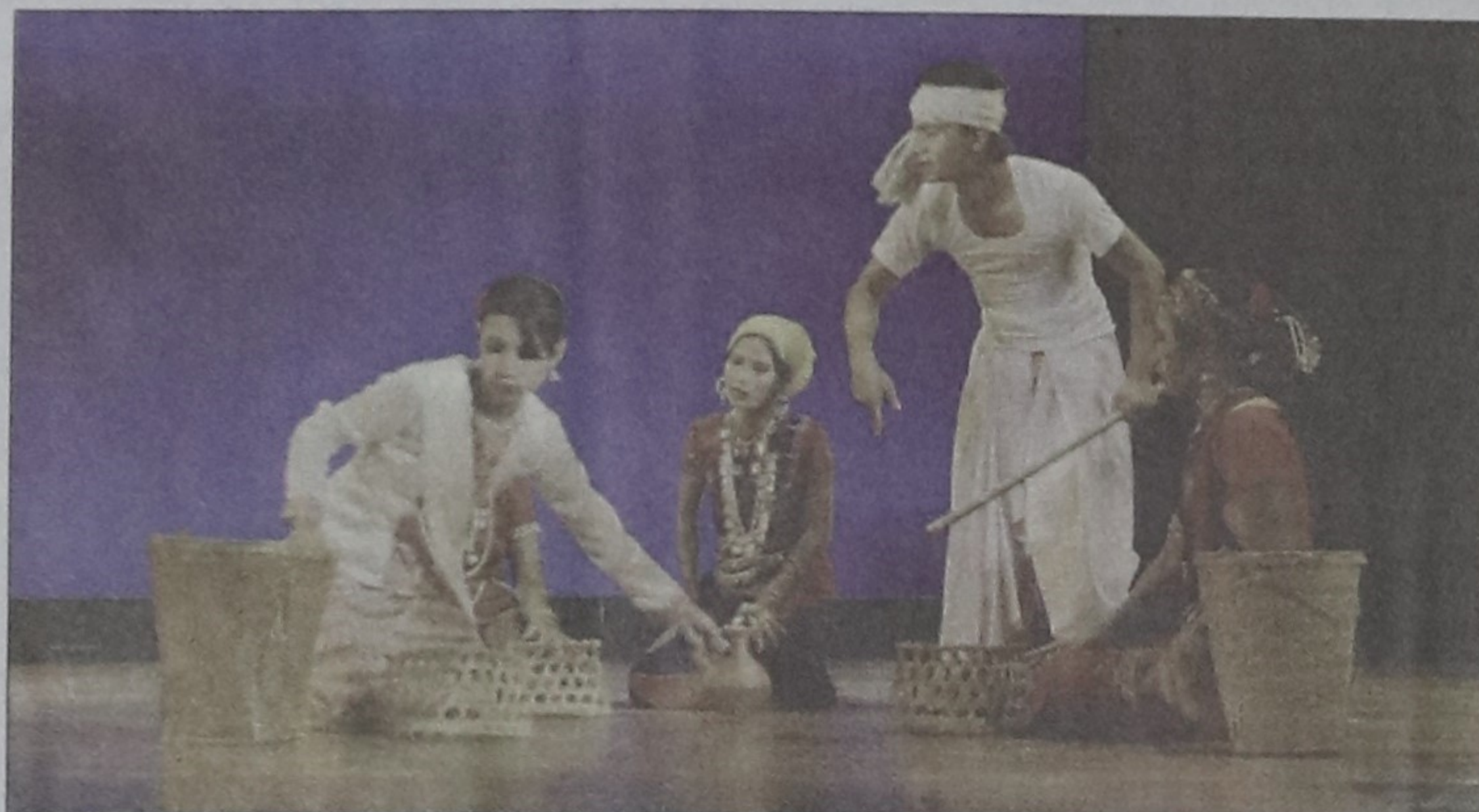
Artistes of ethnic groups perform in Rang Pahar-er Pala

More research-oriented programme featuring the traditions of ethnic minority groups is