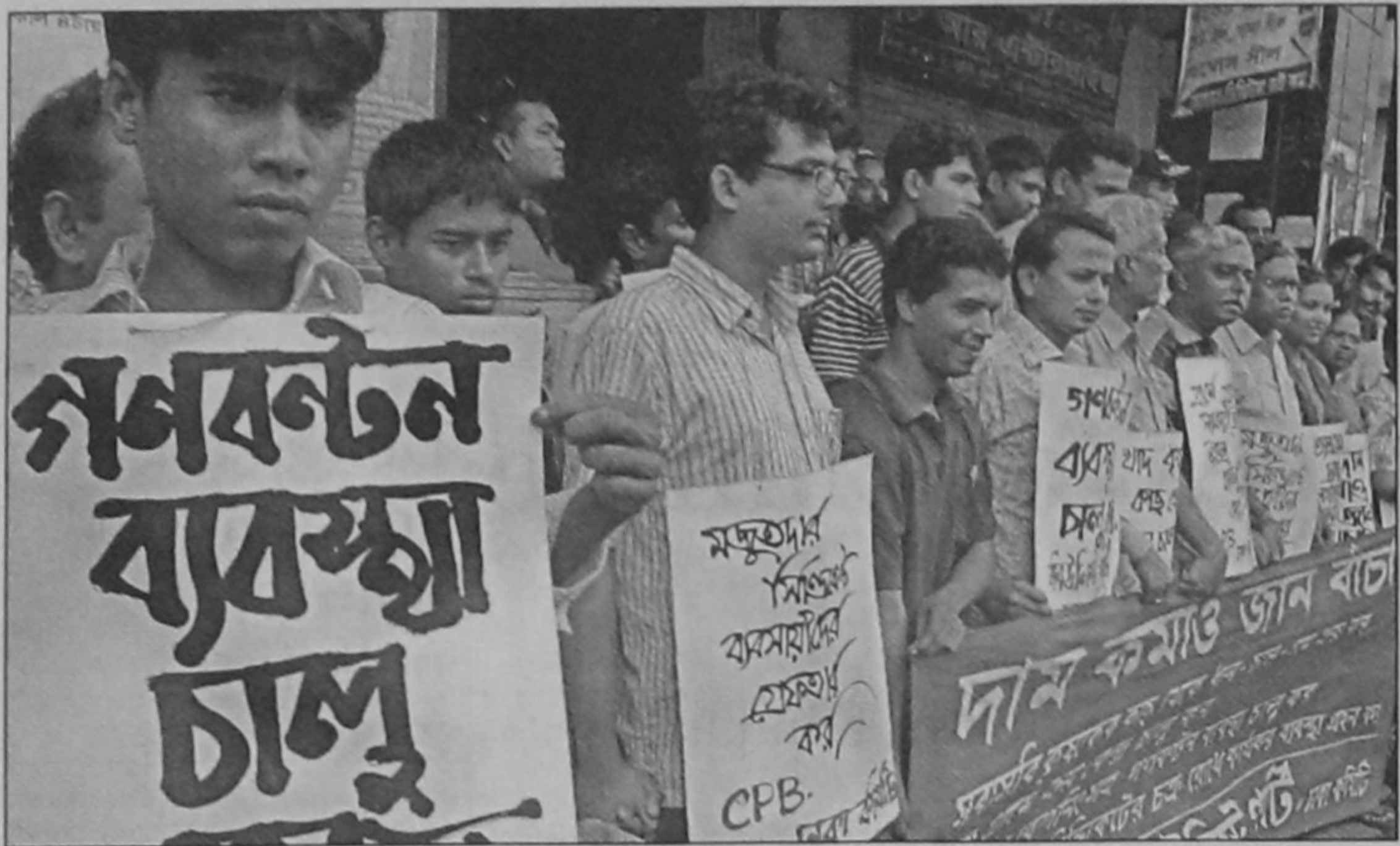
Communist Party of Bangladesh forms a human chain in front of the party office at Purana Paltan in the city yesterday protesting price hike of essentials and demanding introduction of rationing system.

Relatives and admirers are requested to pray for eternal peace of her departed soul.