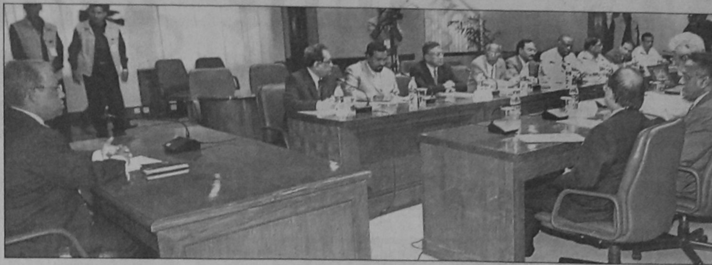
Chief Adviser Fakhruddin Ahmed holds talks with the Jatiya Party as part of the dialogues with the political parties at his office in the city yesterday.

In the writ petition, they stated that the caretaker government has recently taken a decision that no trade licence would be issued to commercial enterprises in the residential areas in Dhaka.