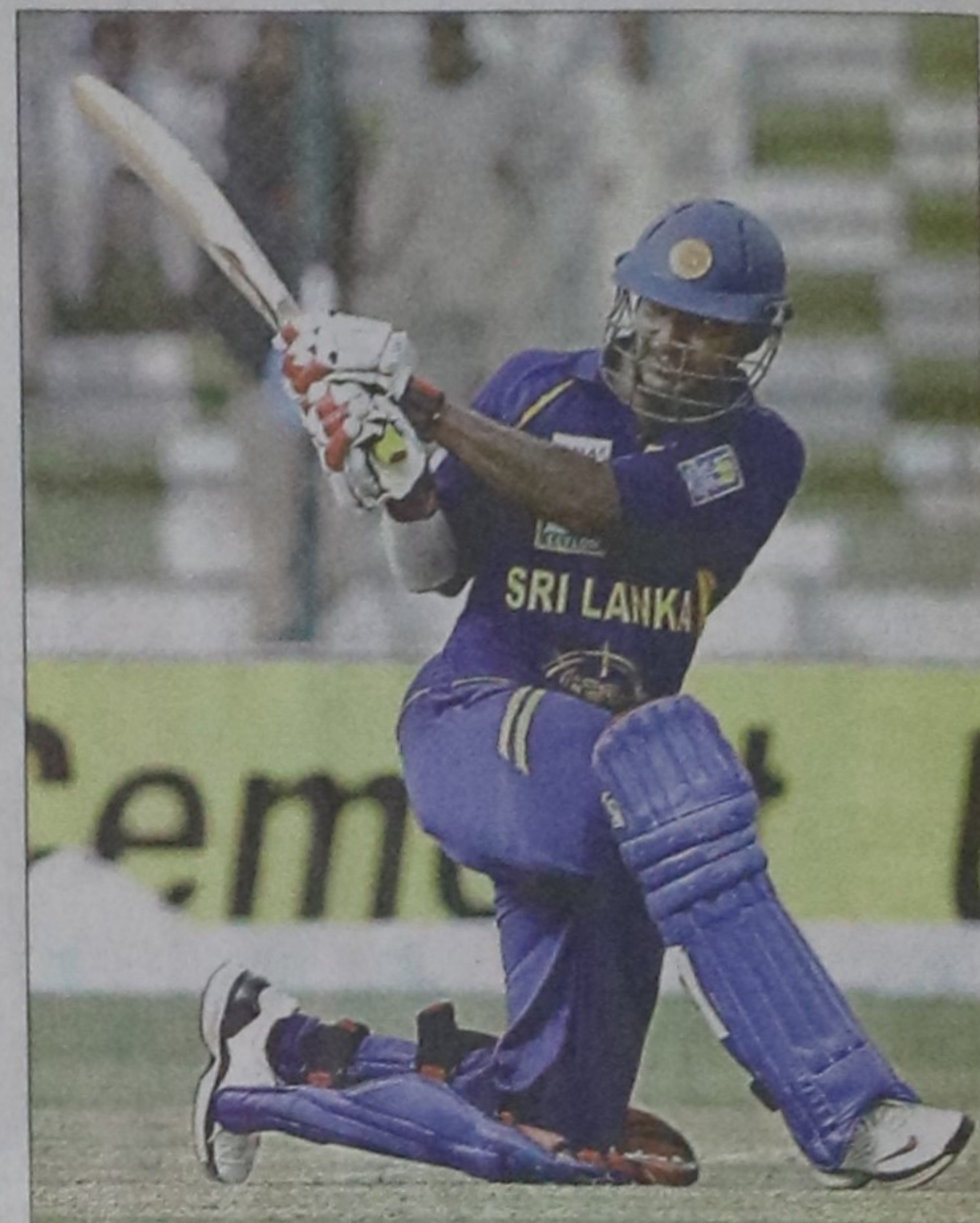
Sri Lanka's batting mainstay Kumar Sangakkara sweeps during their Asia Cup Super League match against Pakistan at the National Stadium in Karachi yesterday.