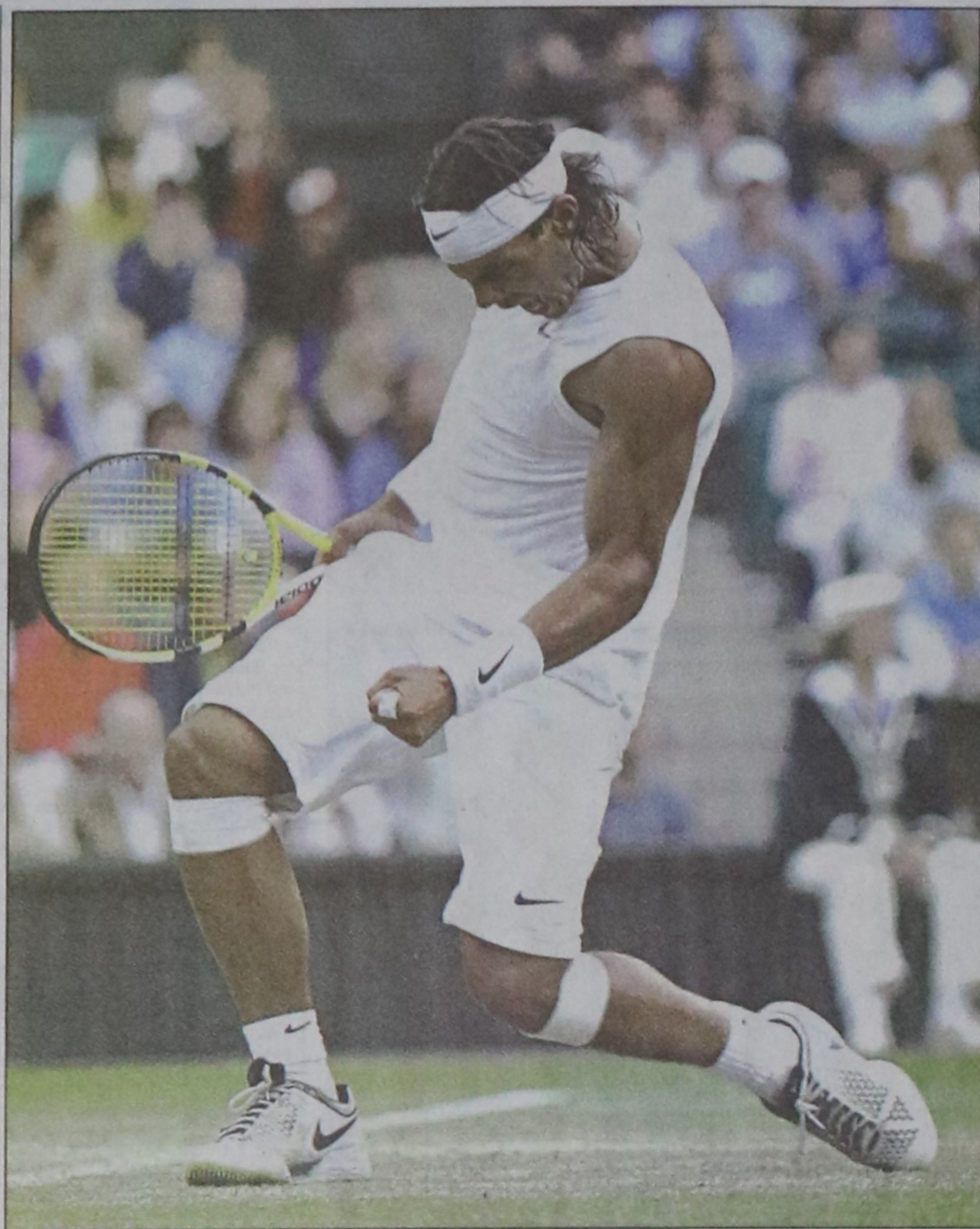
Spainiard Rafael Nadal celebrates after beating Nicolas Kiefer of Germany in the third round of the Wimbledon Championships at the All England Club in London on Saturday.

A win against Italy last week ended what was seen as a "curse", in which Spain had lost three times on penalties in the quarter-finals of major competitions, and on the same date, June 22. In Thursday's semifinal, they demolished Russia 3-0.