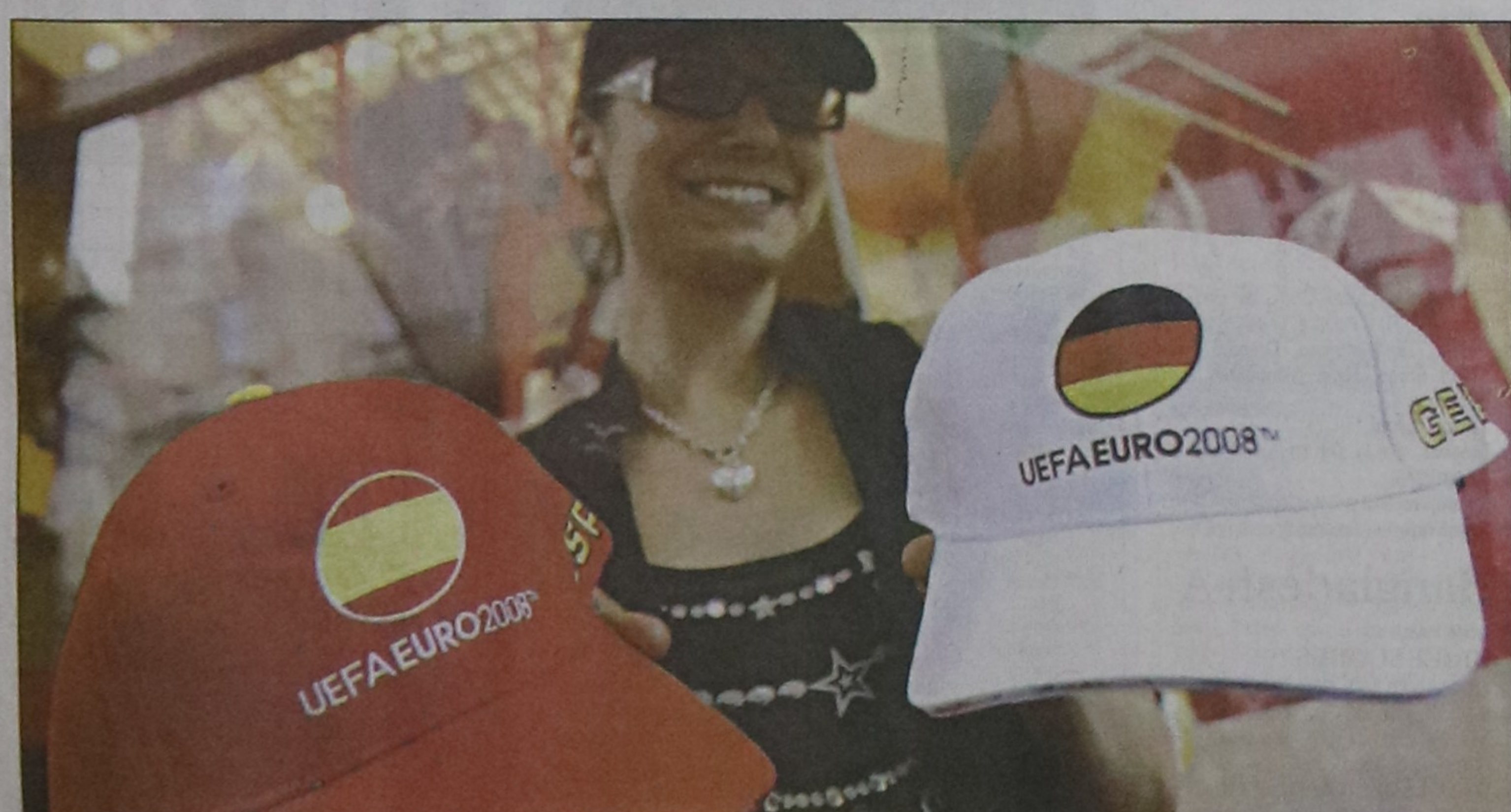
CHOOSE YOUR ONE: A sales girl in a merchandise shop displays red and white caps that symbolise the shirts of the two finalists of the Euro 2008 Spain and Germany in Vienna on Friday. The Austrian capital will host the final today.