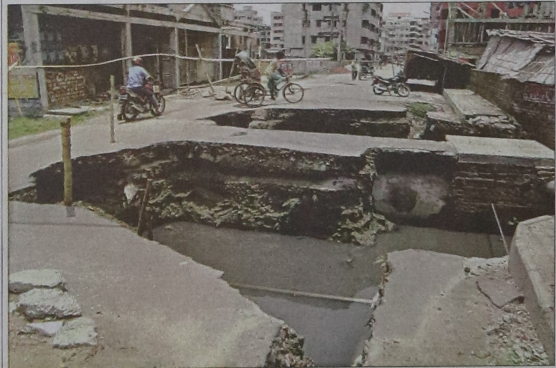
This road leading to Sikder Medical College Hospital at Rayer Bazar in the capital has been in this state for the last two months as Dhaka Wasais installing sewer lines.