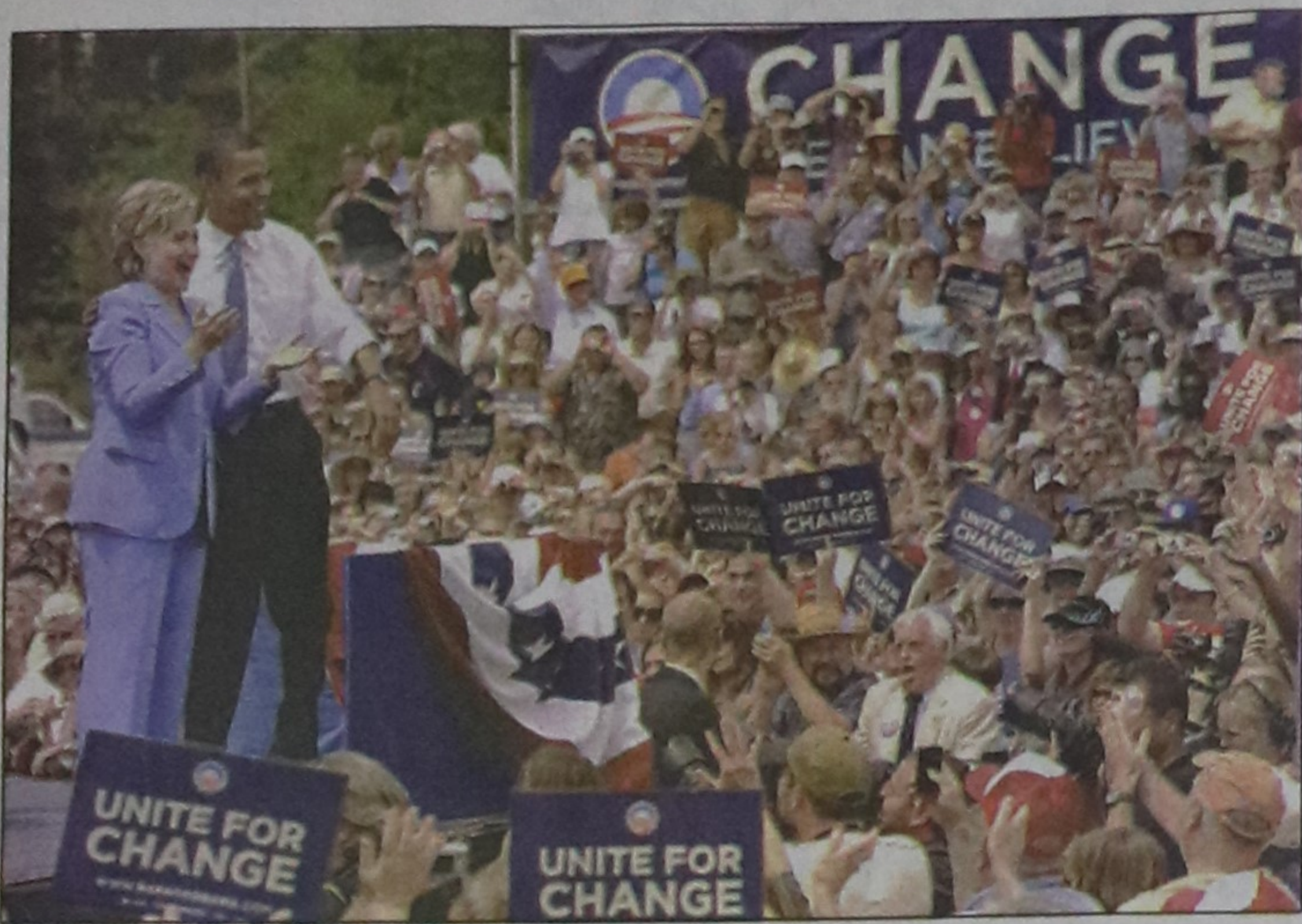
US Democratic presidential candidate Illinois Senator Barack Obama and former candidate Senator Hillary Clinton (D-NY) greet supporters during a rally in Unity, New Hampshire on Friday. Obama said Friday that he, the Democrats and the American people need both Hillary and Bill Clinton on board to change the nation.