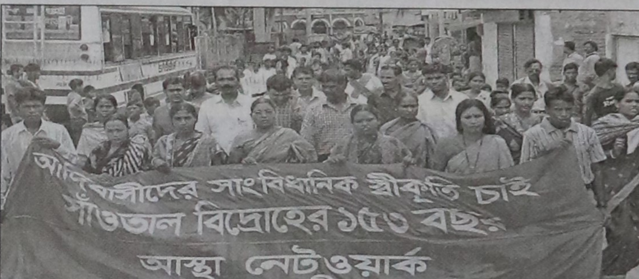
Astha Network brings out a procession marking the 153rd anniversary of Santal revolution in Rajshahi yesterday.