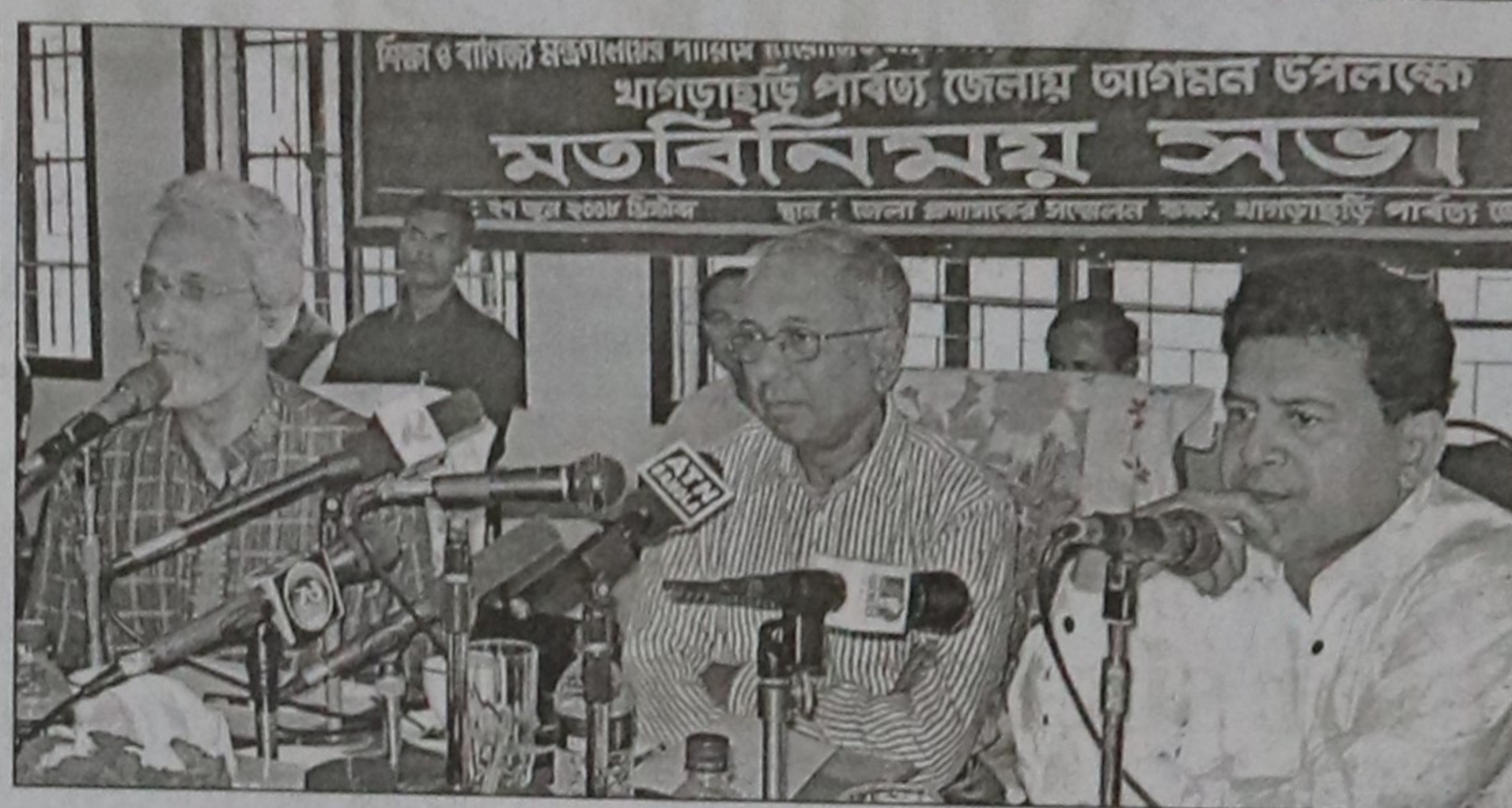
Commerce and Education Adviser Dr Hossain Zillur Rahman speaks at a view exchange meeting at Deputy Commissioner's conference room in Khagrachhari yesterday. On his right are Communications Adviser Maj Gen (ret'd) Ghulam Quader and Law Adviser AF Hasan Arif.

NSU is the first and premier private university in the country that has been playing a pioneering role in providing quality higher education.