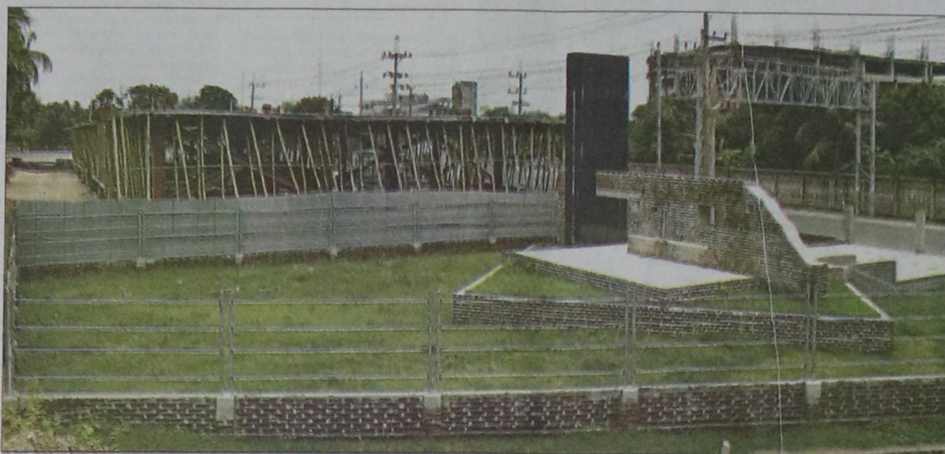
University of Science and Technology Chittagong (USTC) constructing an academic building on the site of historic Pahartali mass killing ground.