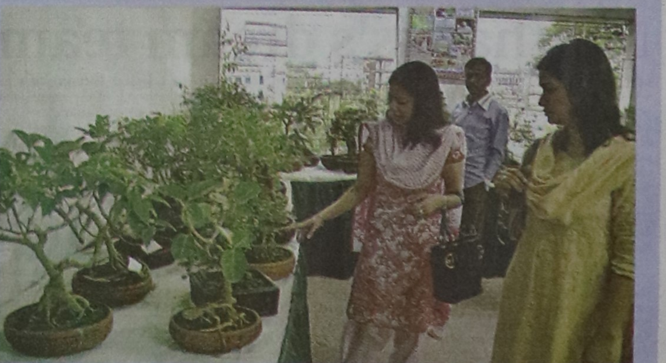
Visitors admire Bansai plants at an exhibition titled "Urban garden Show" organised by Chittagong Club on Thursday.